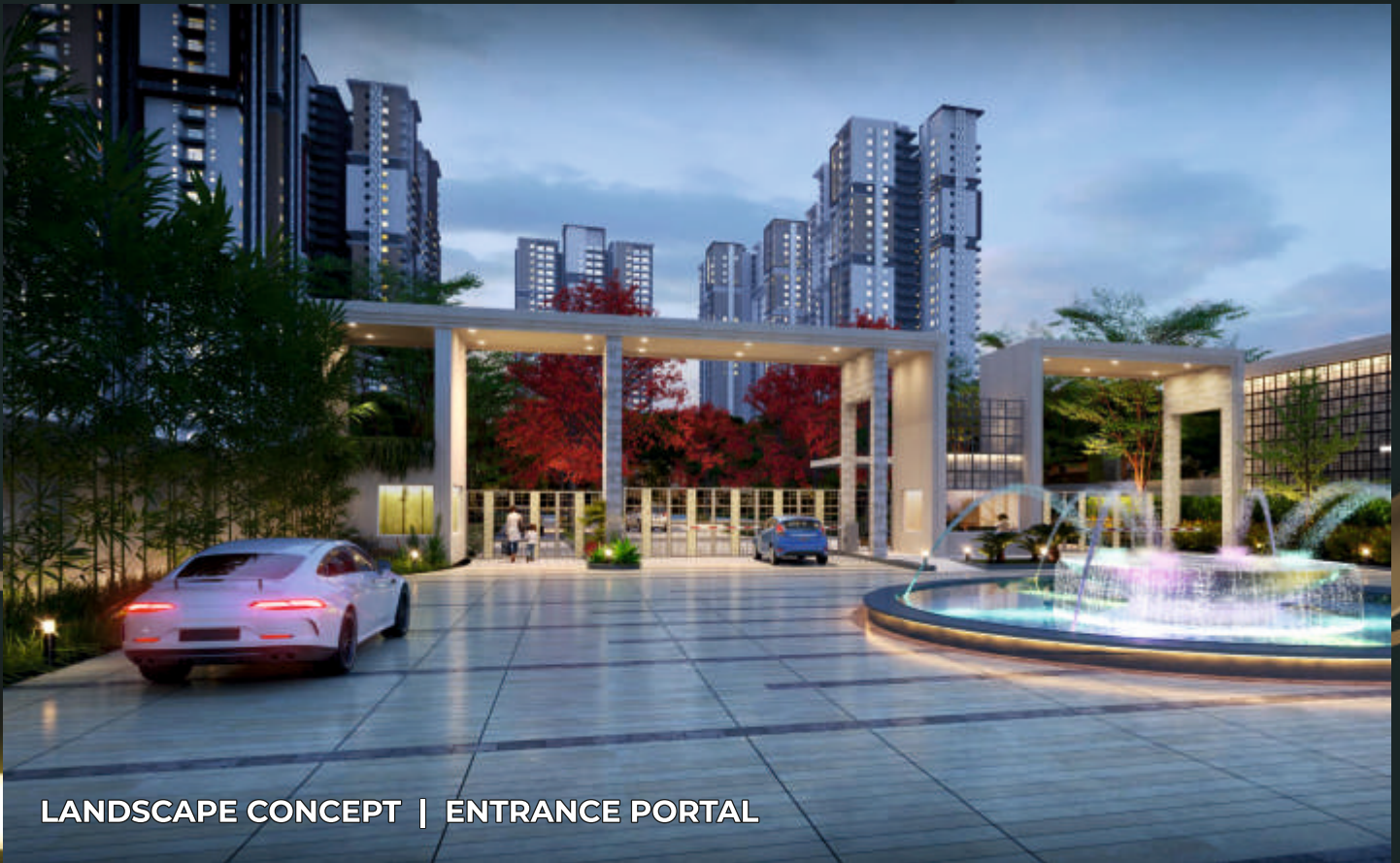
LANDSCAPE CONCEPT | ENTRANCE PORTAL