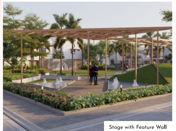
Stage with Feature Wall