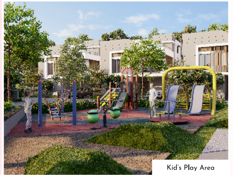
Kid's Play Area