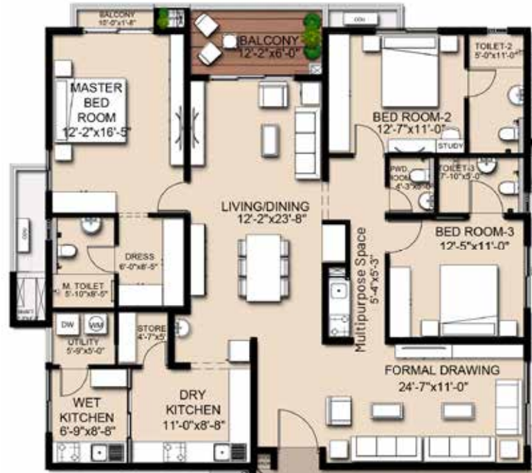
unit - 08