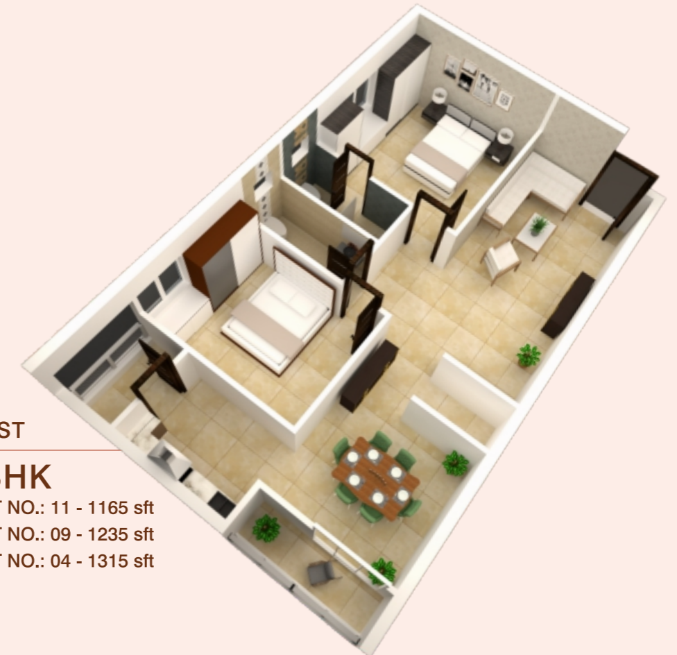
WEST 2BHK FLAT NO.: 11 - 1165 sft FLAT NO.: 09 - 1235 sft FLAT NO.: 04 - 1315 sft