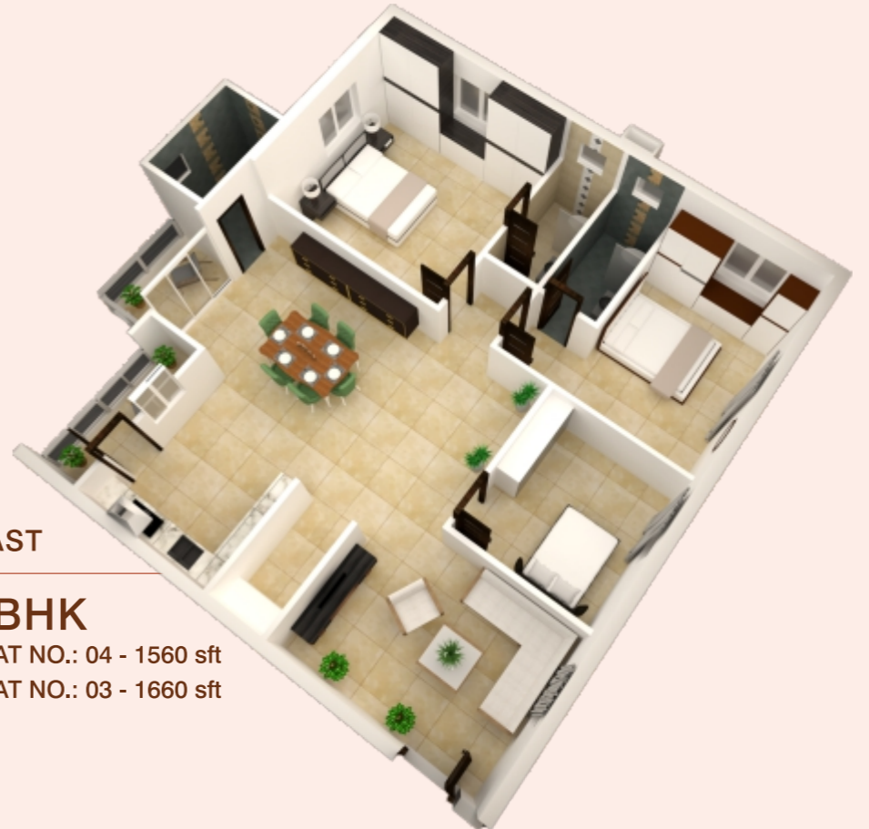
EAST 3BHK FLAT NO.: 04 - 1560 sft FLAT NO.: 03 - 1660 sft