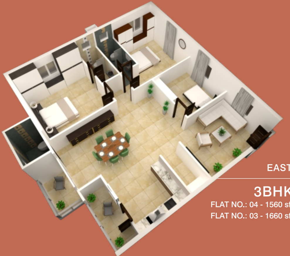
EAST 3BHK FLAT NO.: 04 - 1560 sft FLAT NO.: 03 - 1660 sft