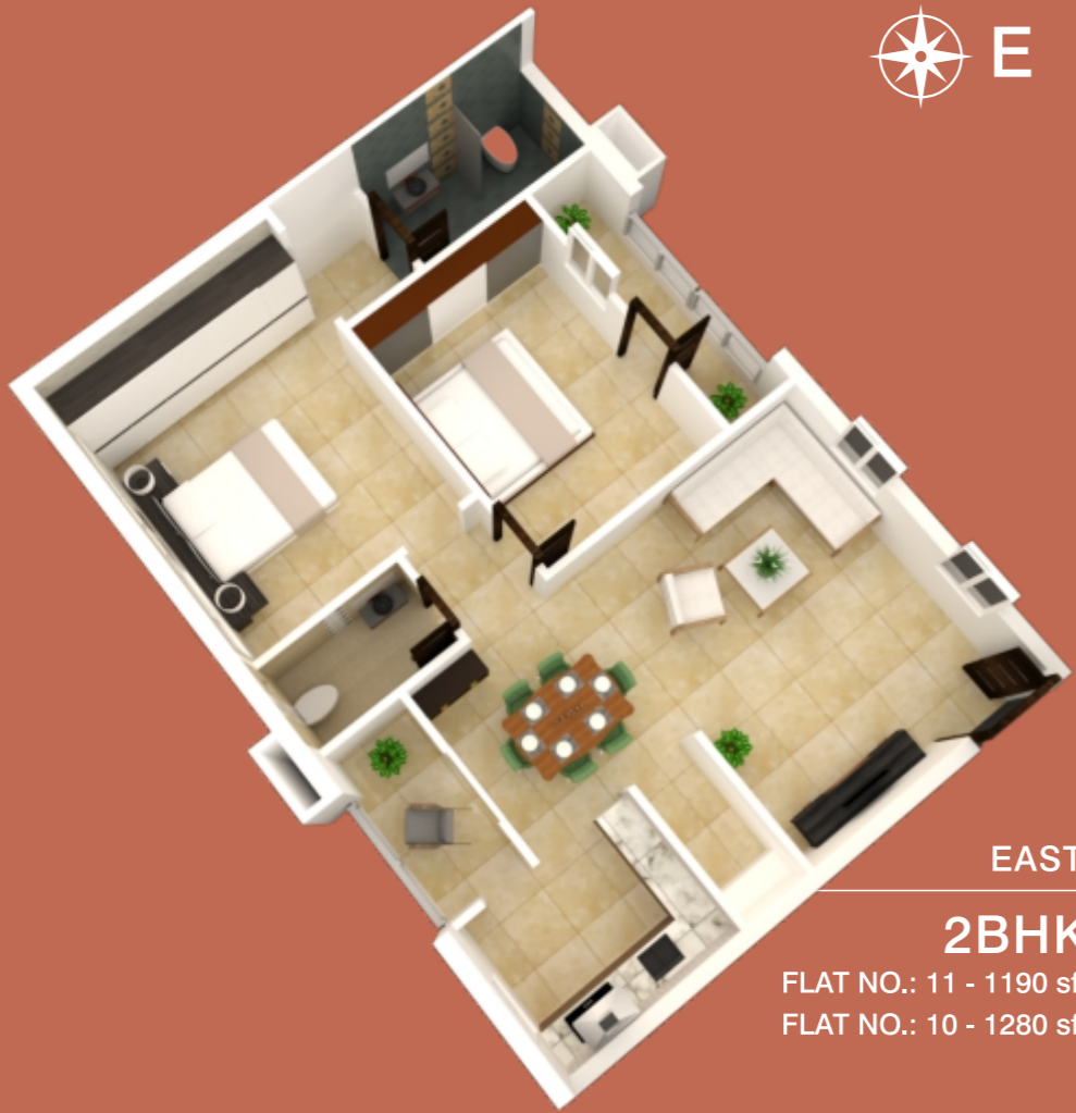
EAST 2BHK FLAT NO.: 11 - 1190 sft FLAT NO.: 10 - 1280 sft