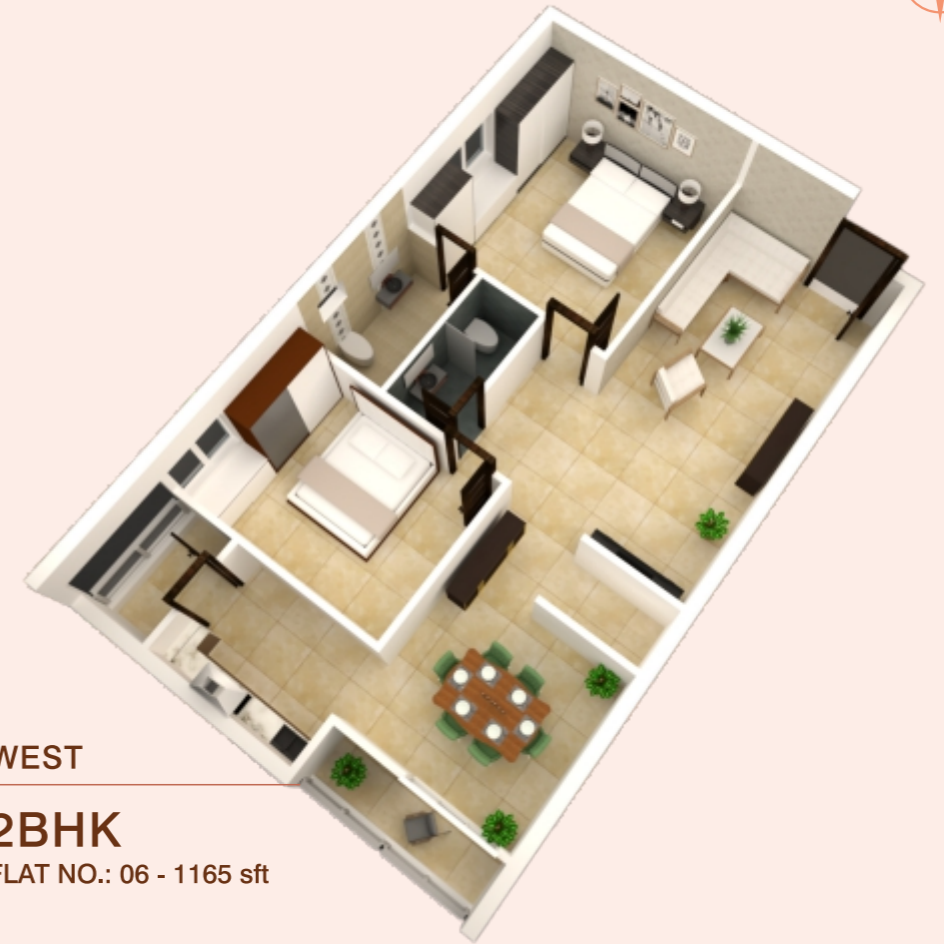
WEST 2BHK FLAT NO.: 06 - 1165 sft