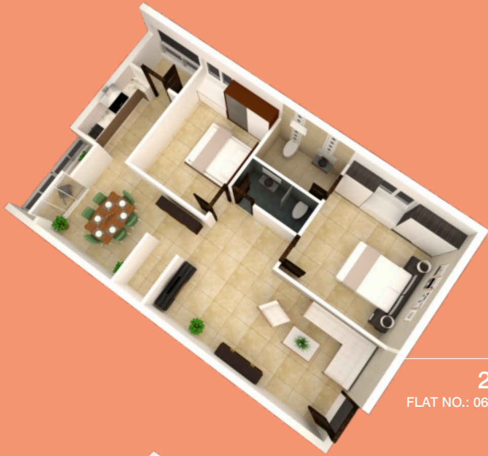
WEST 2BHK FLAT NO.: 06 - 1165 sft