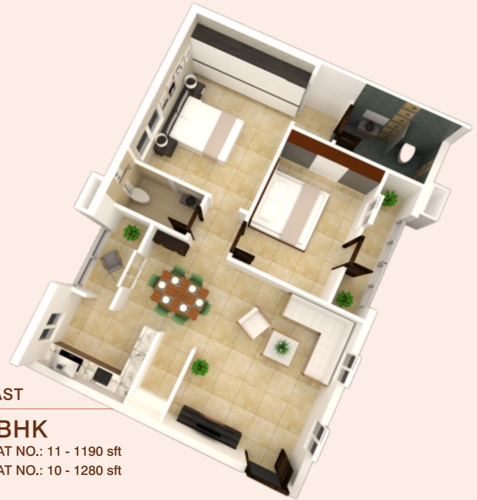
EAST 2BHK FLAT NO.: 11 - 1190 sft FLAT NO.: 10 - 1280 sft