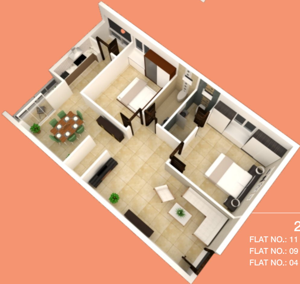
WEST 2BHK FLAT NO.: 11 - 1165 sft FLAT NO.: 09 - 1235 sft FLAT NO.: 04 - 1315 sft