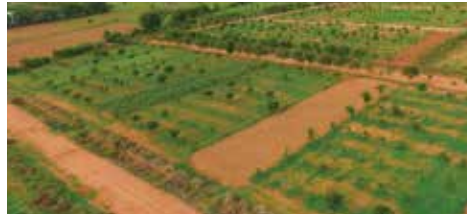
Eco Fields @ Shamshabad