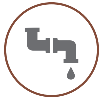
Underground Sewerage Lines