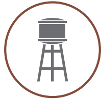
Over Head Water Tank