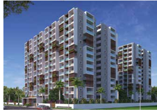
Myspace @ Bachupally