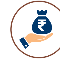
Clear Title With High Returns