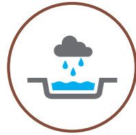
Rainwater Harvesting Pits