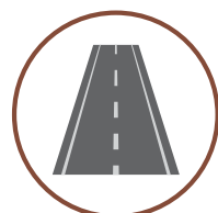
33ft & 60ft Wide Black Top Roads