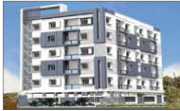
Ananya Hill Top @ Manikonda