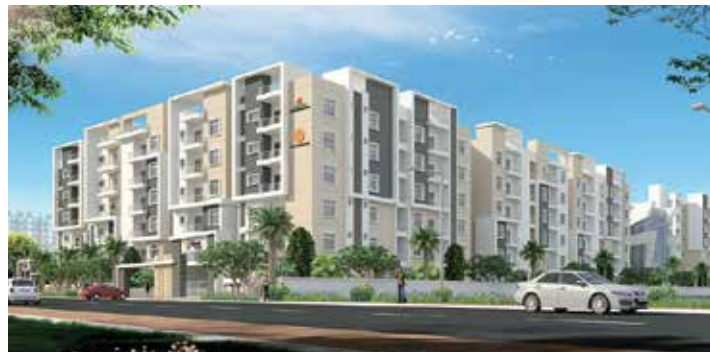
Begonia Homes @ Manikonda