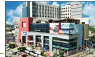
Commercial & Residential @ Amberpet