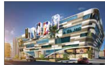
Multiplex @ Manikonda