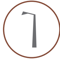
Ornamental Street Lighting