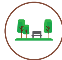
Well Developed Parks