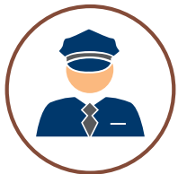
24 Hours Security