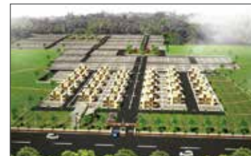
Open Plots & Villas