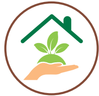
Pollution Free Area