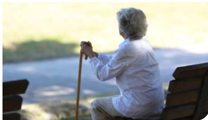
Sr. Citizen Sitting Area