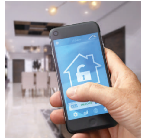
Welcome home the future

Exquisite features grace your home from the outside, while intelligently designed living areas and bedrooms make space for delights to pep up your every day.