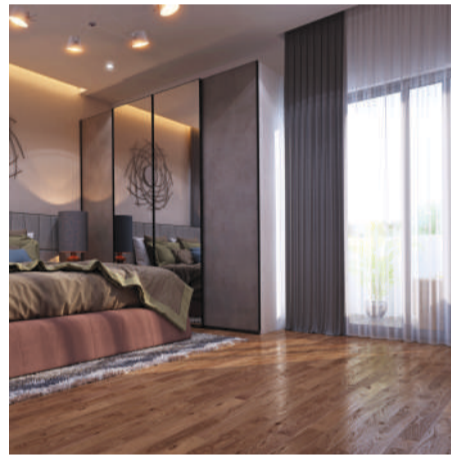
Large windows for the small things

Put up your feet and let time tick by as you take in the open view from the splendid balcony. Sip coffee one after the other as it's really hard to relinquish the coveted balcony seat and end the affair with the wind in your hair.