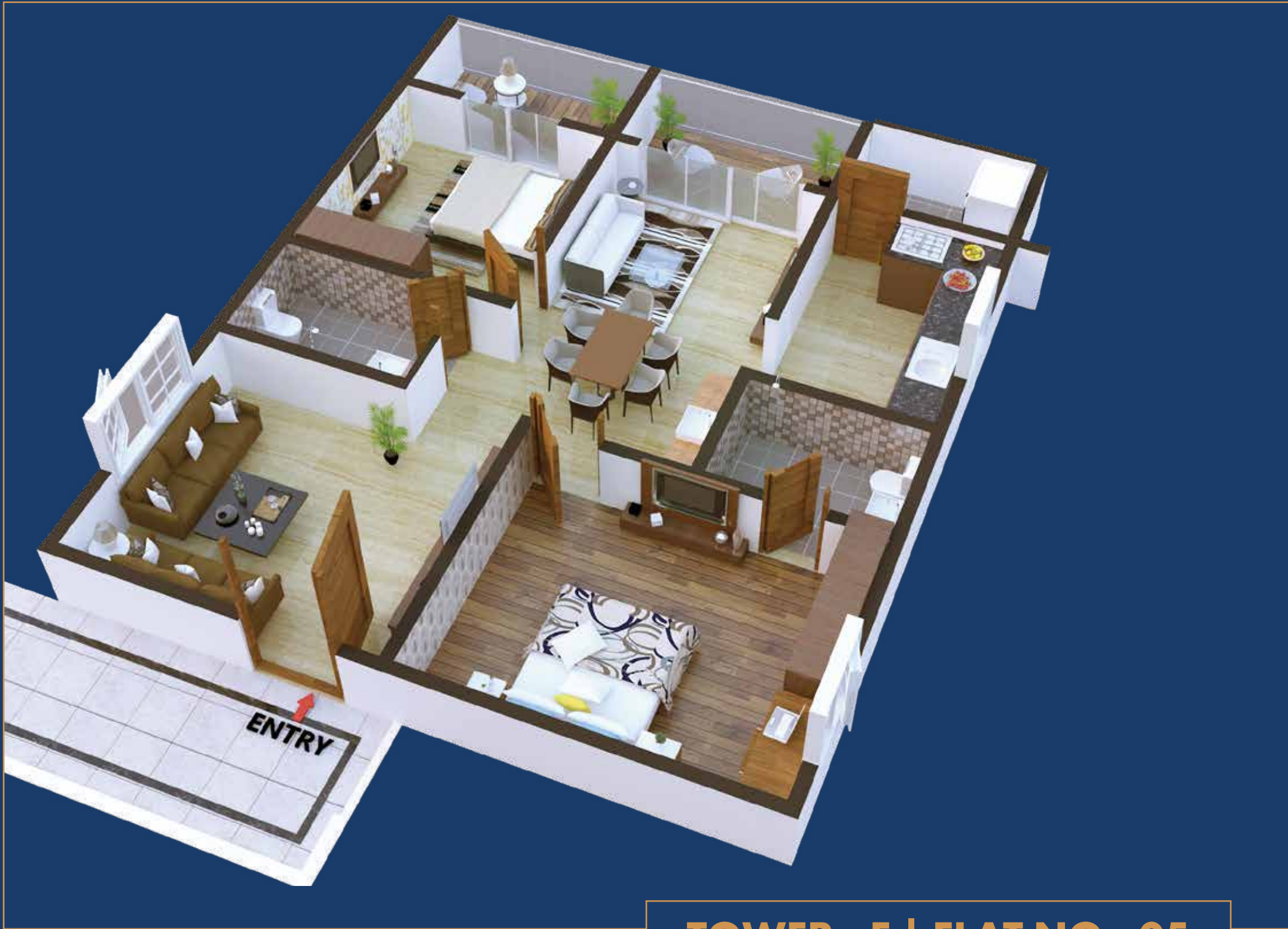
TOWER - F | FLAT NO - 05