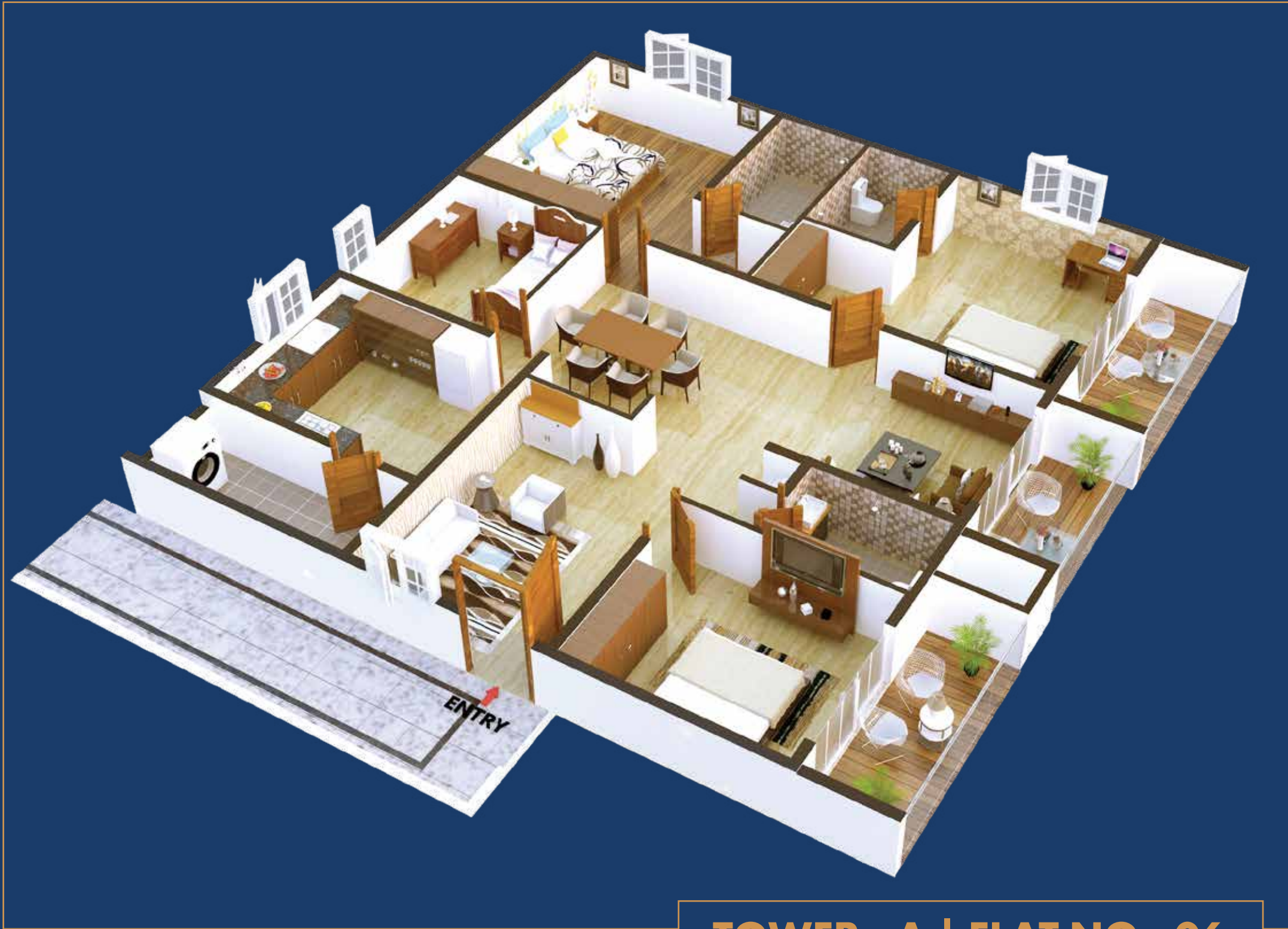
TOWER - A | FLAT NO - 06