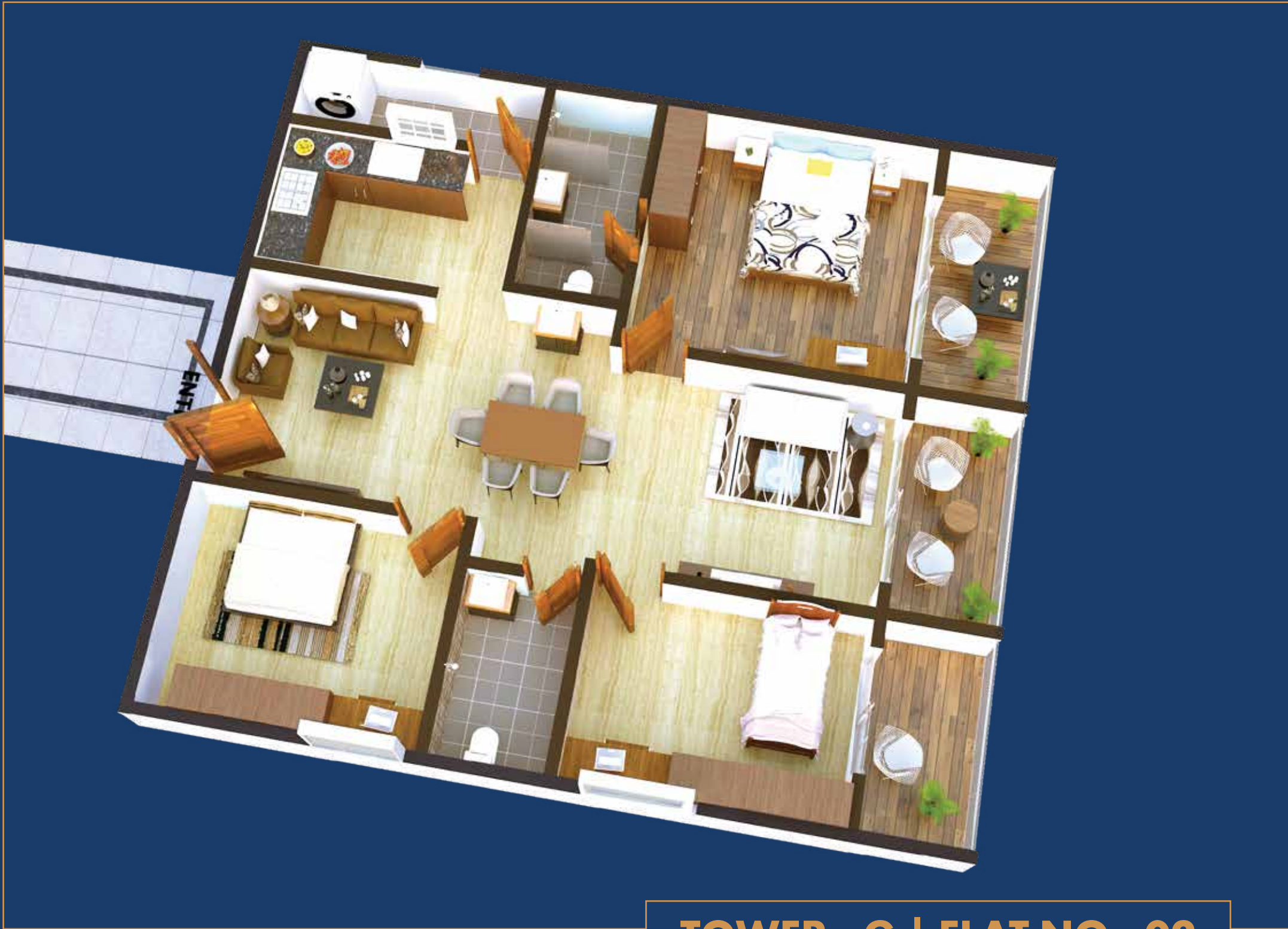
TOWER - G | FLAT NO - 02