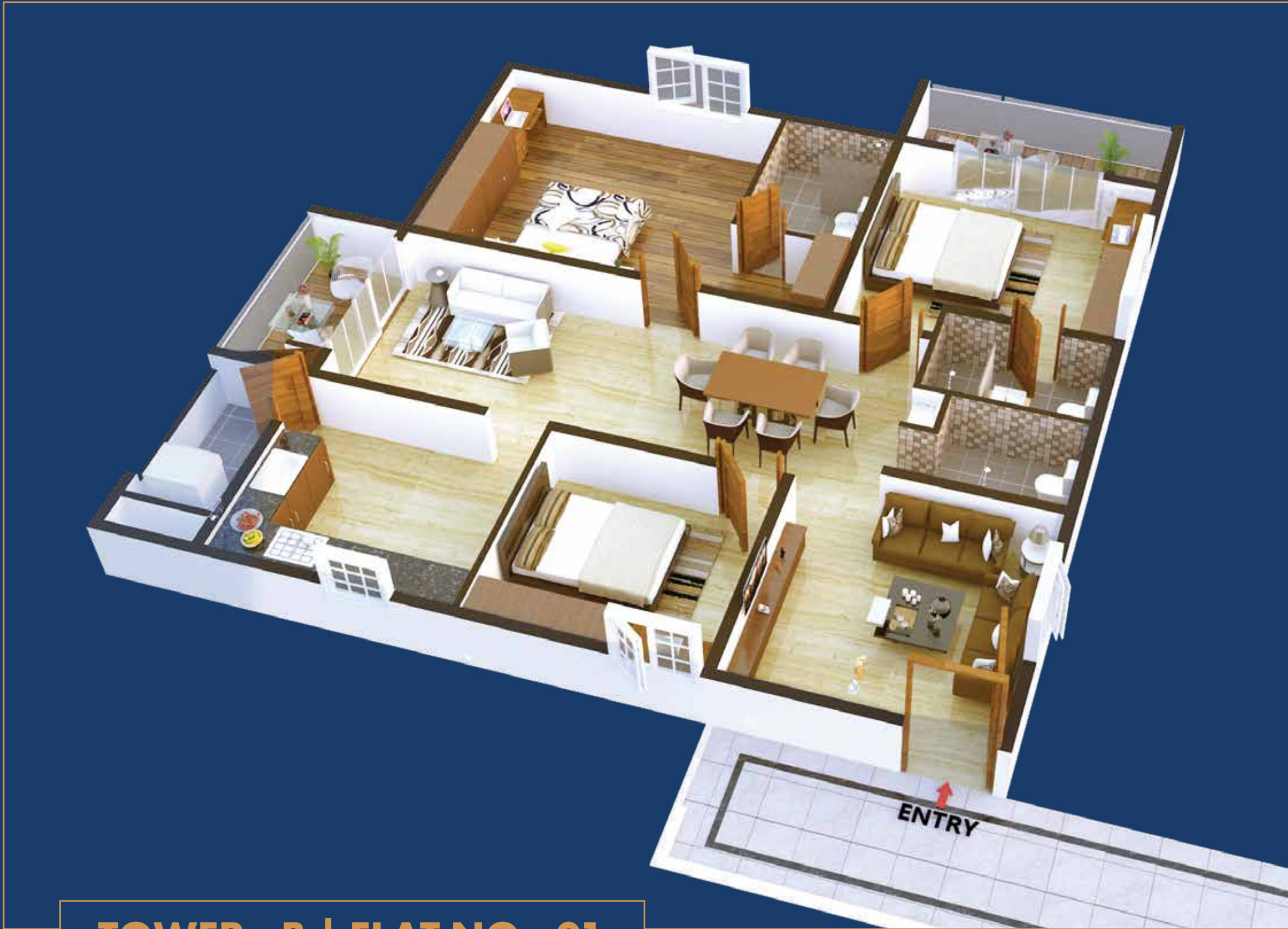
TOWER - B | FLAT NO - 01