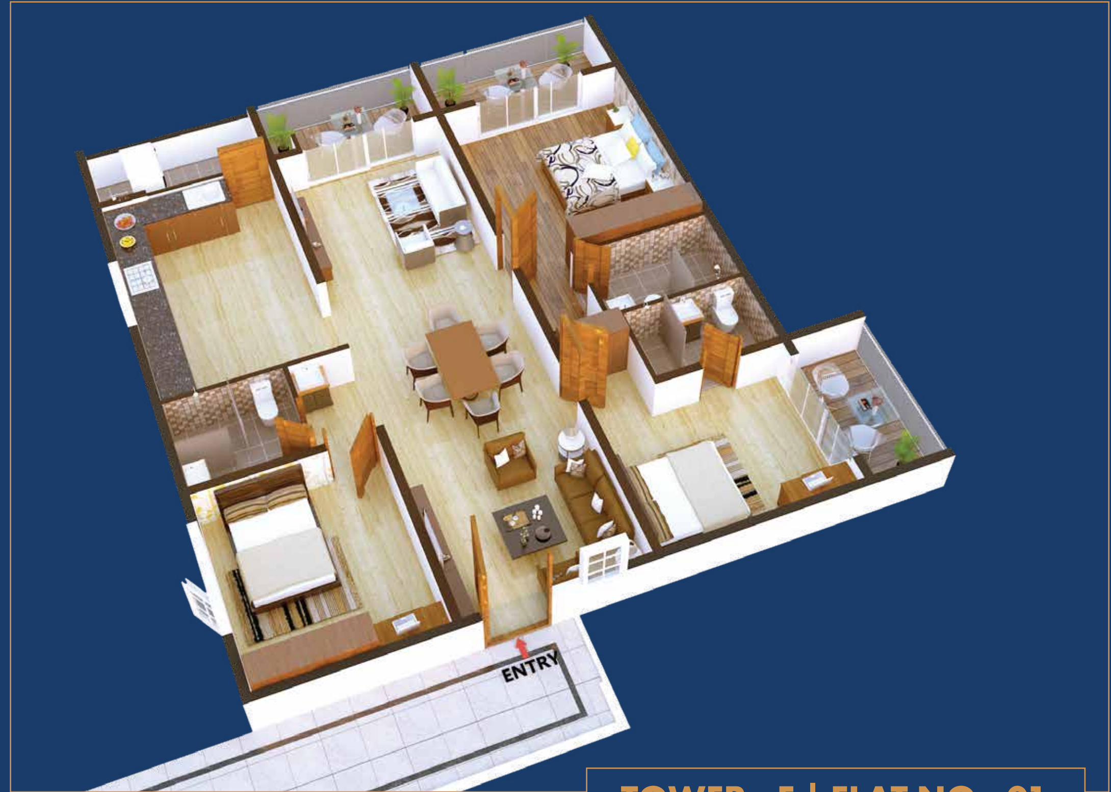
TOWER - E | FLAT NO - 01