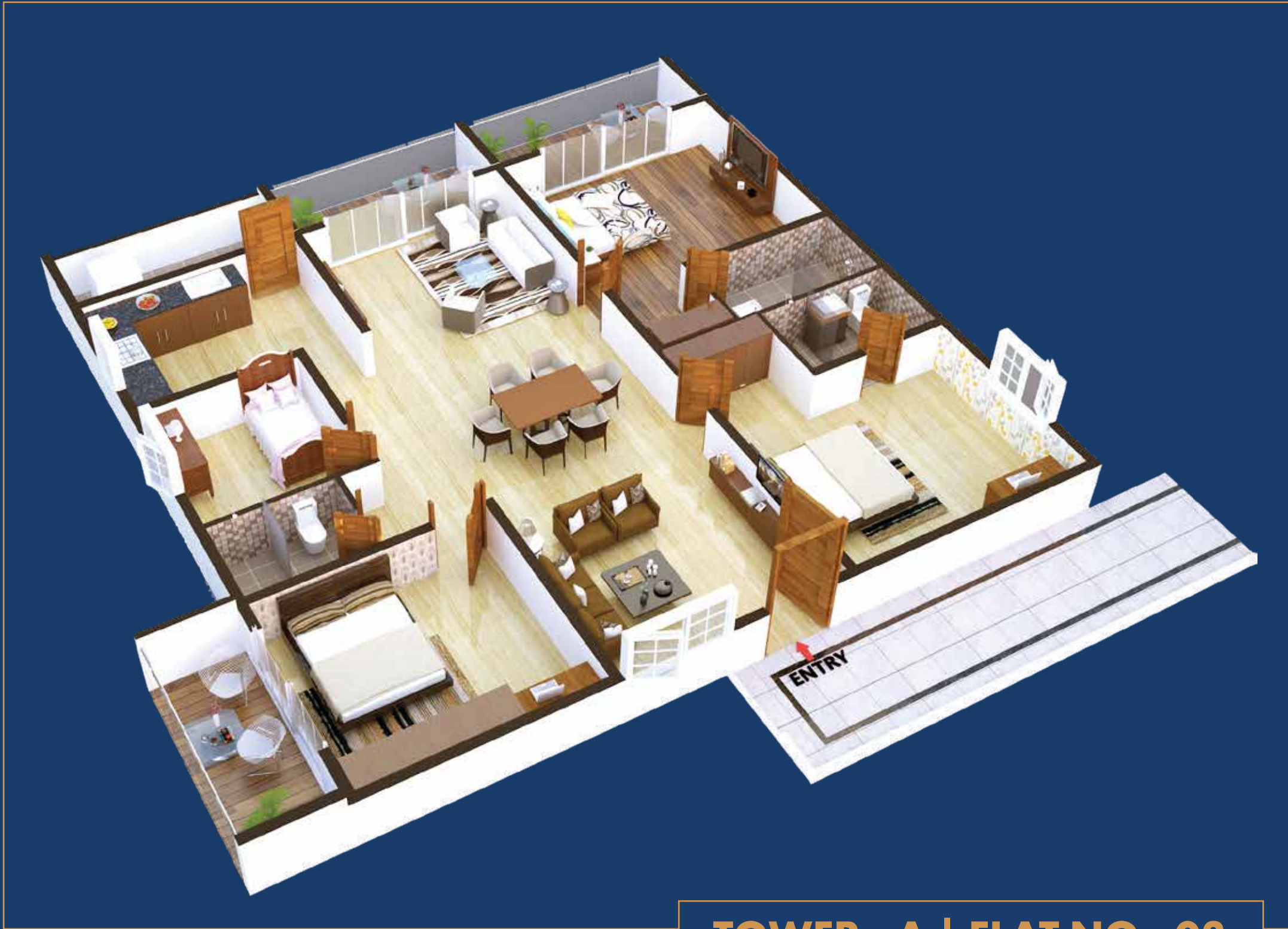
TOWER - A | FLAT NO - 03