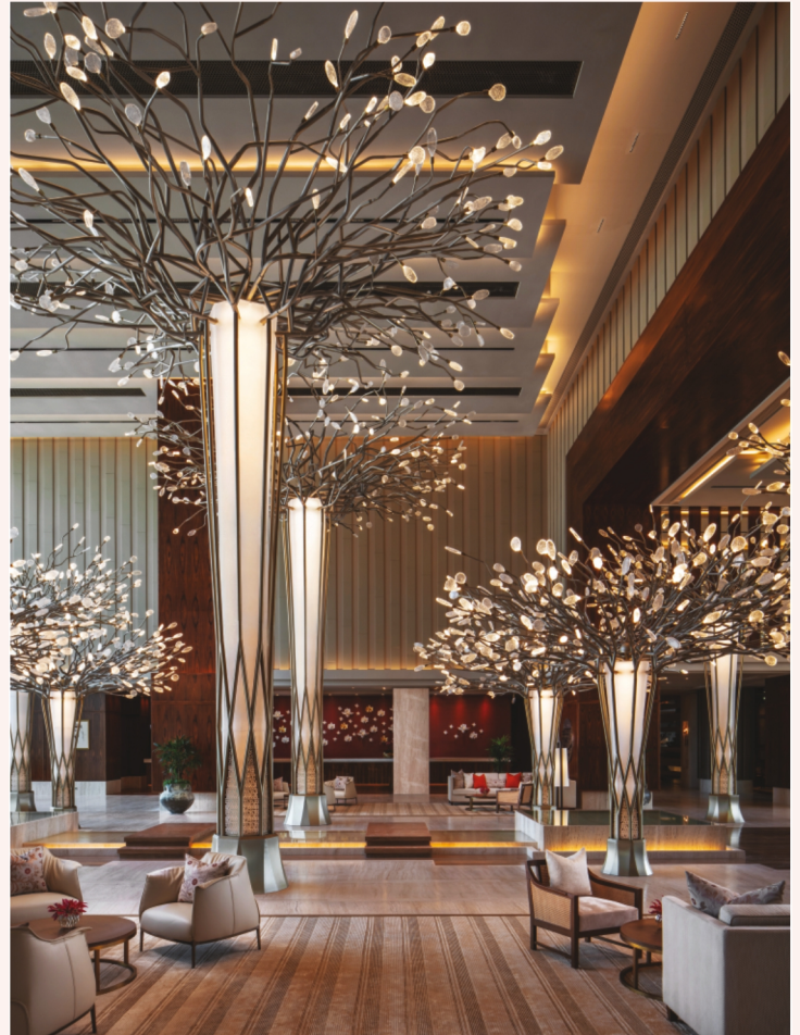
Triple Height Ceiling