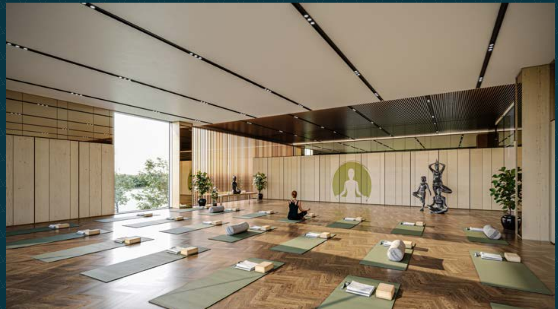
Aerobics / Yoga / Meditation Space