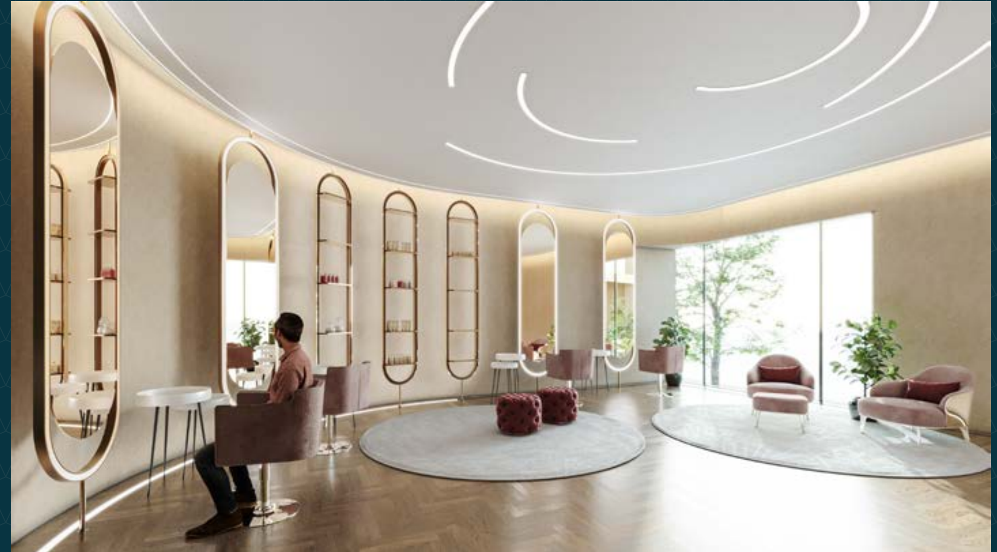
Spa / Saloon