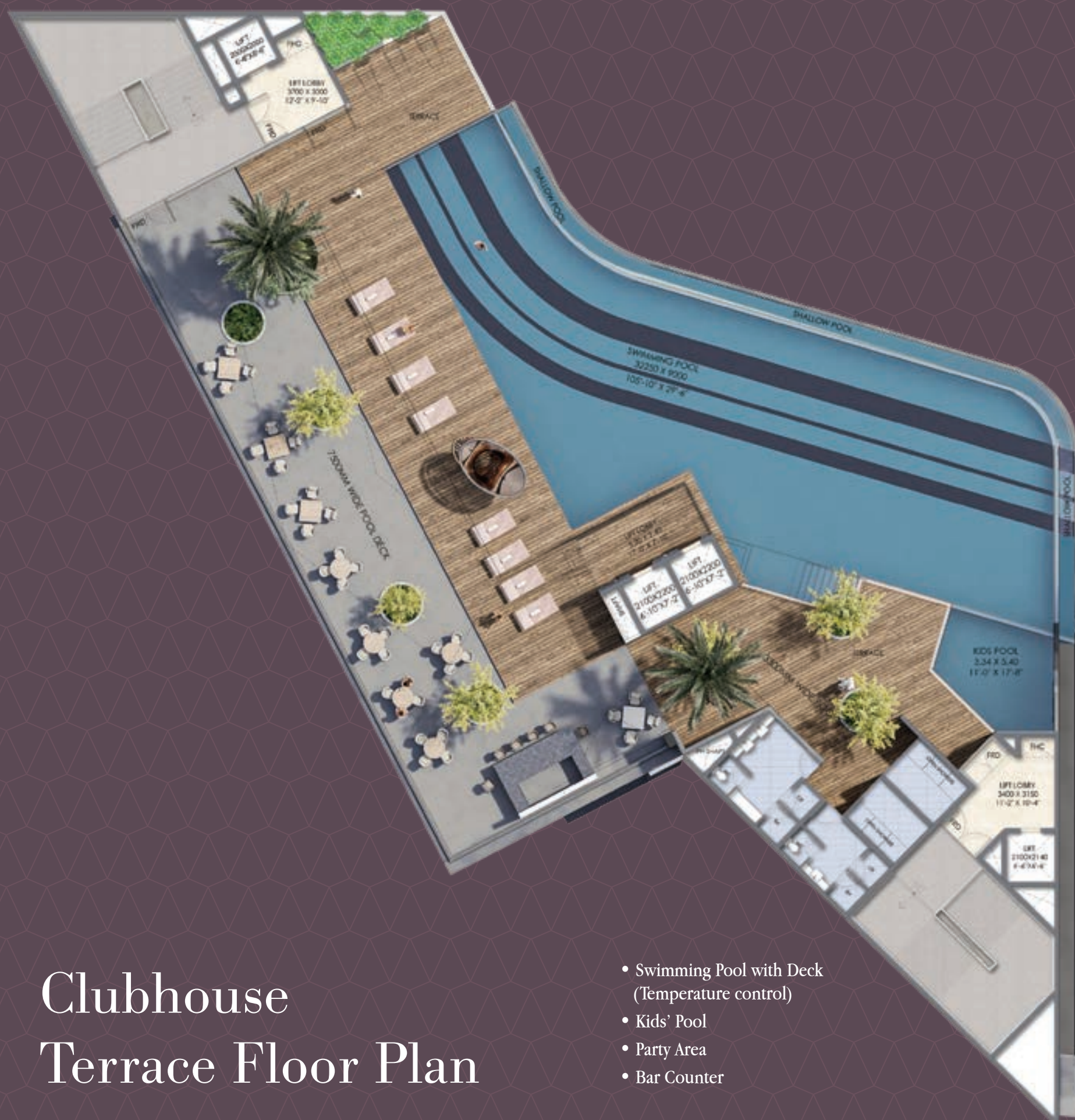
Clubhouse Terrace Floor Plan

Revive & refresh at the enthralling terrace of the clubhouse, with an enchanting pool at the top and a dedicated party deck for a desirable experience.