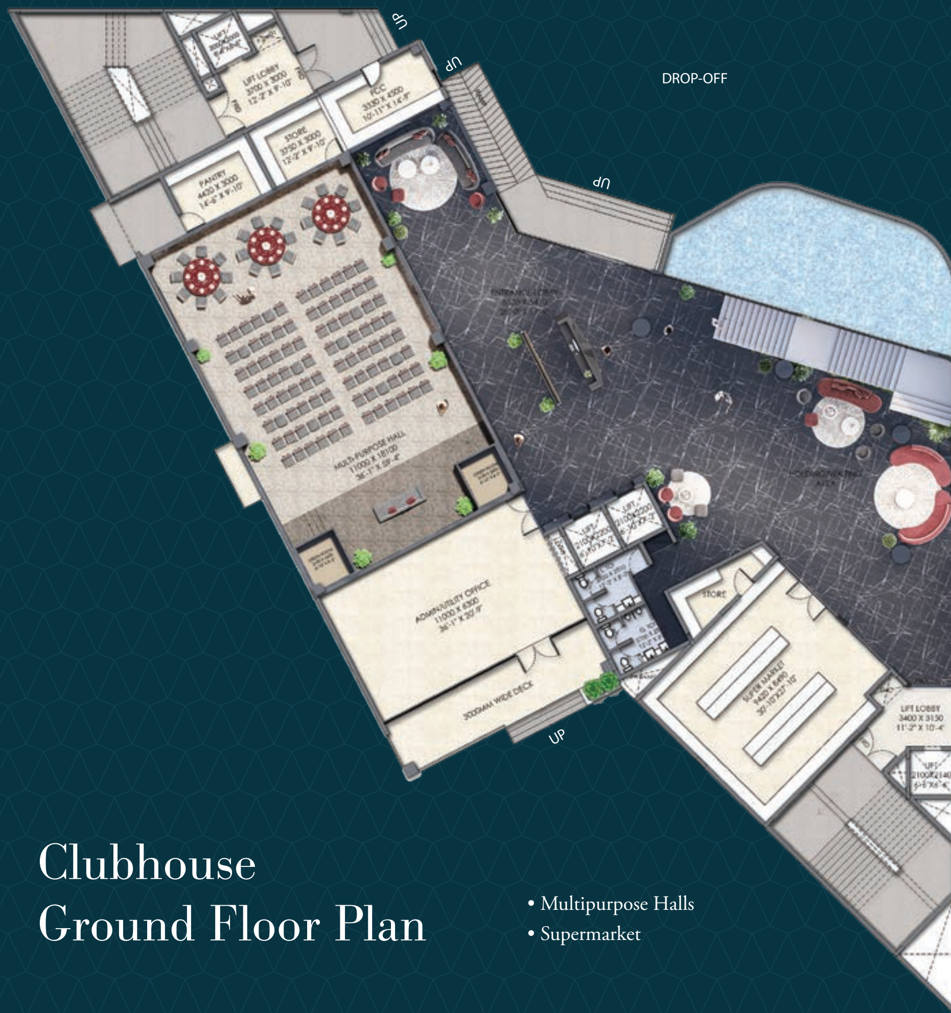
Clubhouse Ground Floor Plan

Your time at the clubhouse will be so exciting that you start loving your life like never before and indulge in your favourite activities with a new enthusiasm.