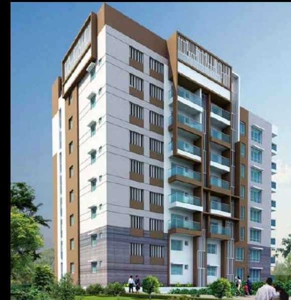
DSR REGANTI PHASE II