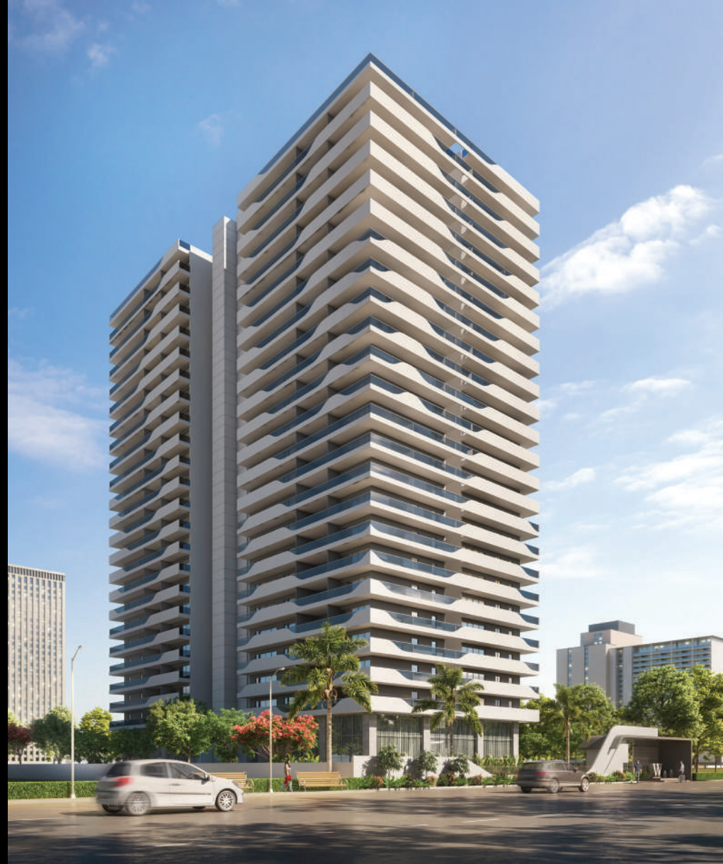
View from south-west side