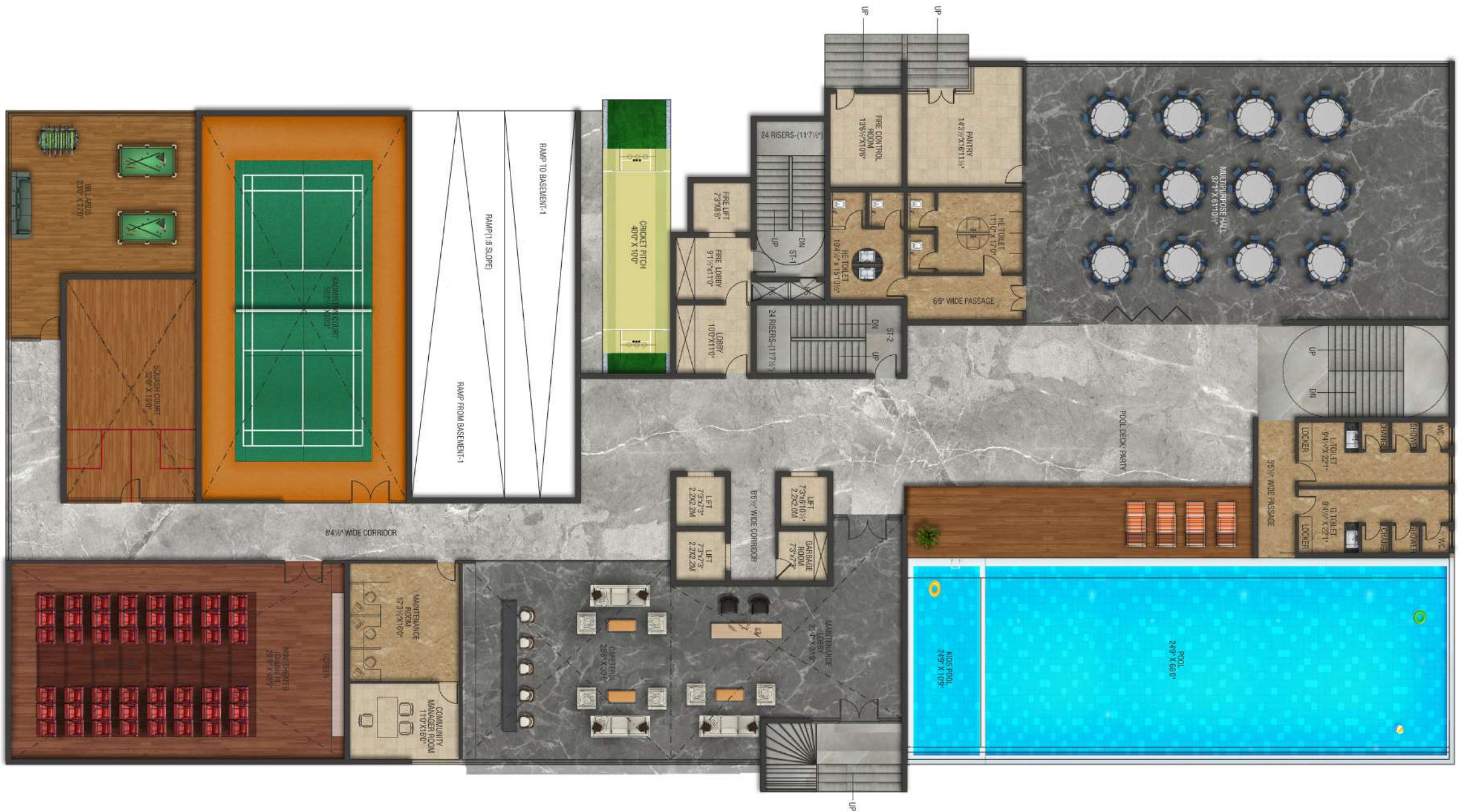
Club House Ground Floor Plan