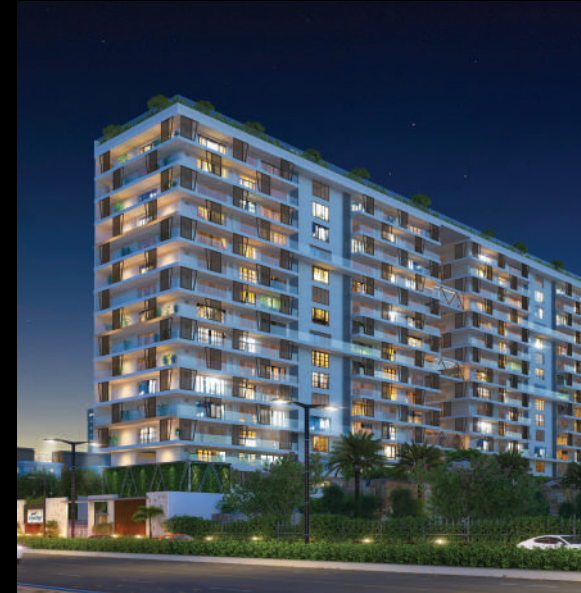
GVK SKY CITY