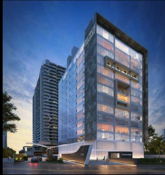
BN TECH SQUARE