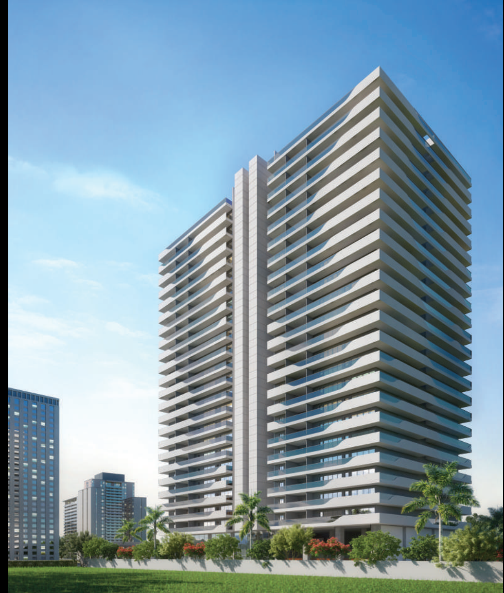
View from the north-east side