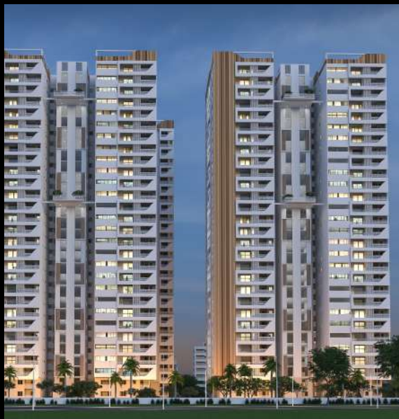
SONTHALIA SKY VILLAS