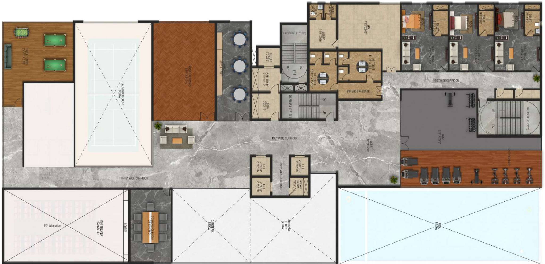
Club House First Floor Plan