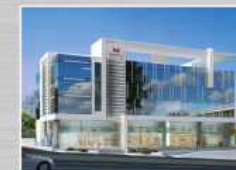
NIHARIKA JUBILEE ONE