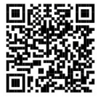
SCAN FOR LOCATION

Site Office: Sy. No. 51, Gundlapochampalli Village Medchal Mandal, Medchal- Malkajgiri Dist.