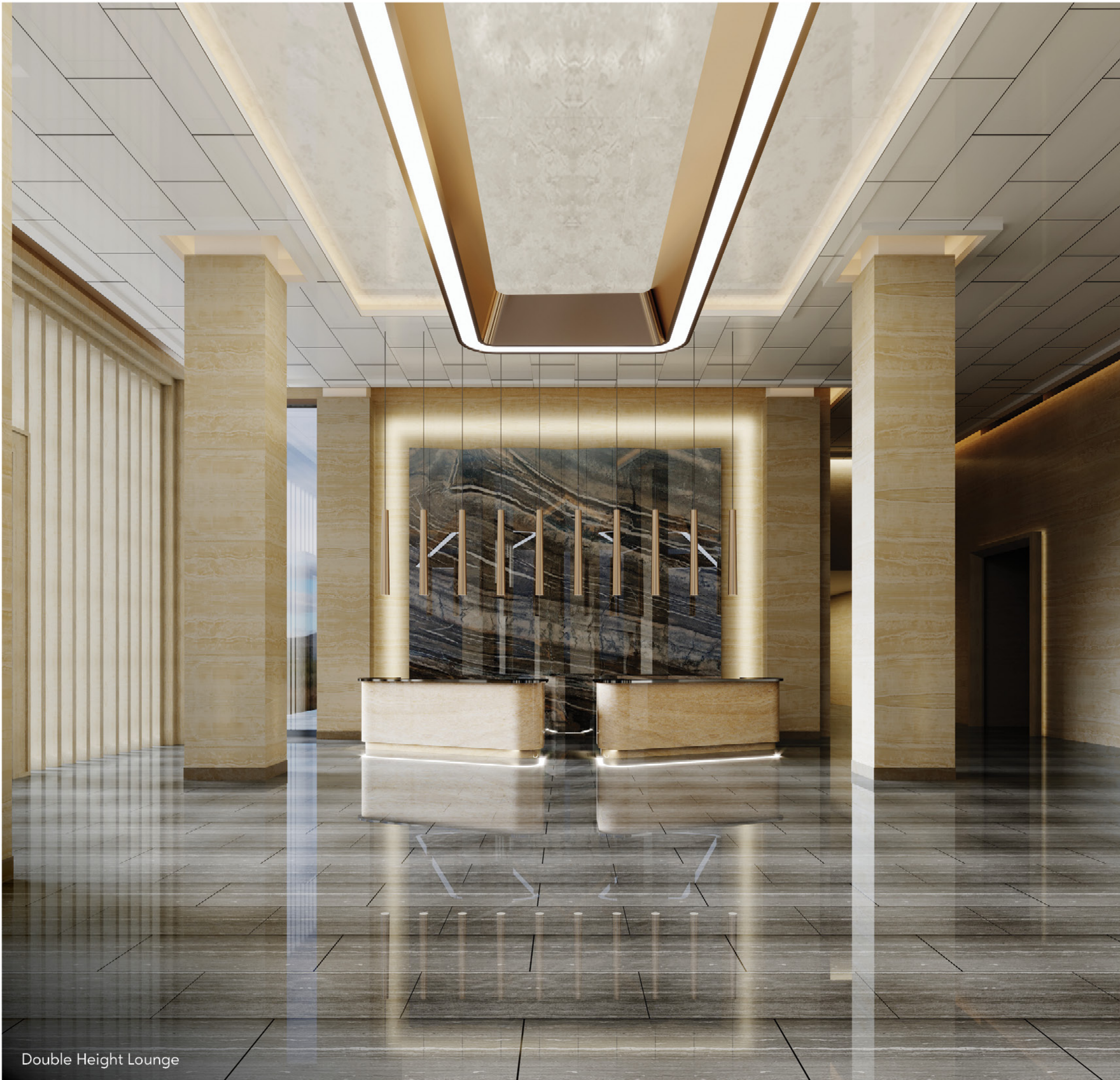
Double Height Lounge