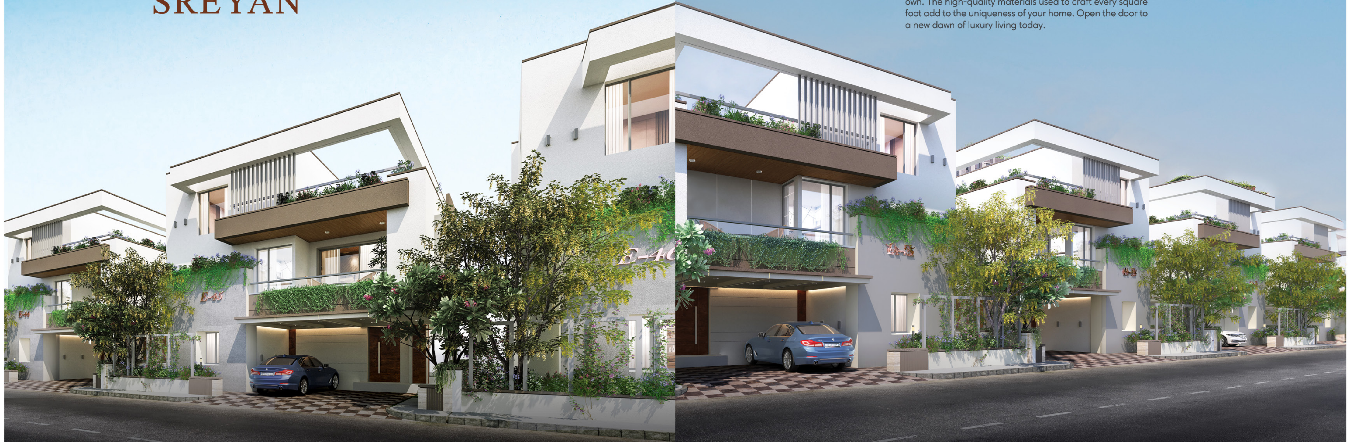
EAST STREET VIEW

From the grand exteriors to the sublime interiors, each villa at SREYAN is a cocoon of blissful living you can proudly own. The high-quality materials used to craft every square foot add to the uniqueness of your home. Open the door to a new dawn of luxury living today.