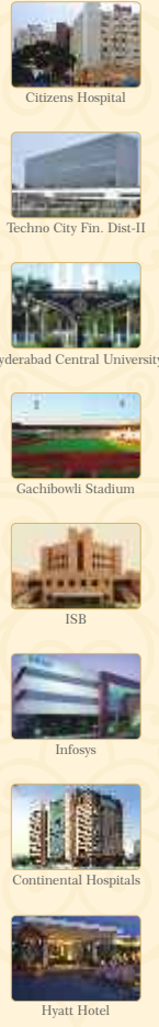
Citizens Hospital Techno City Fin. Dist-II Hyderabad Central University Gachibowli Stadium ISB Infosys Continental Hospitals Hyatt Hotel