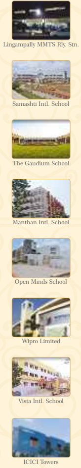
Lingampally MMTS Rly. Stn. SAIL Stock Yard Samashti Int. School The Gaudium School Manthan Int. School Open Minds School Wipro Limited Vista Int. School ICICI Towers