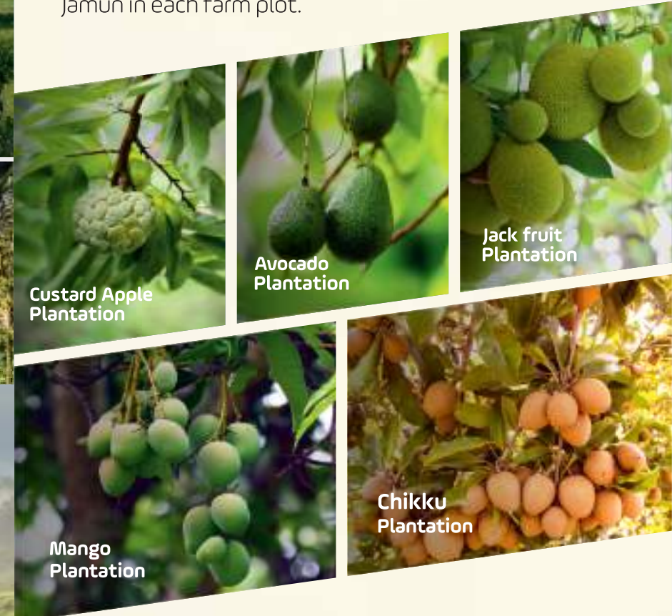
Custard Apple Plantation