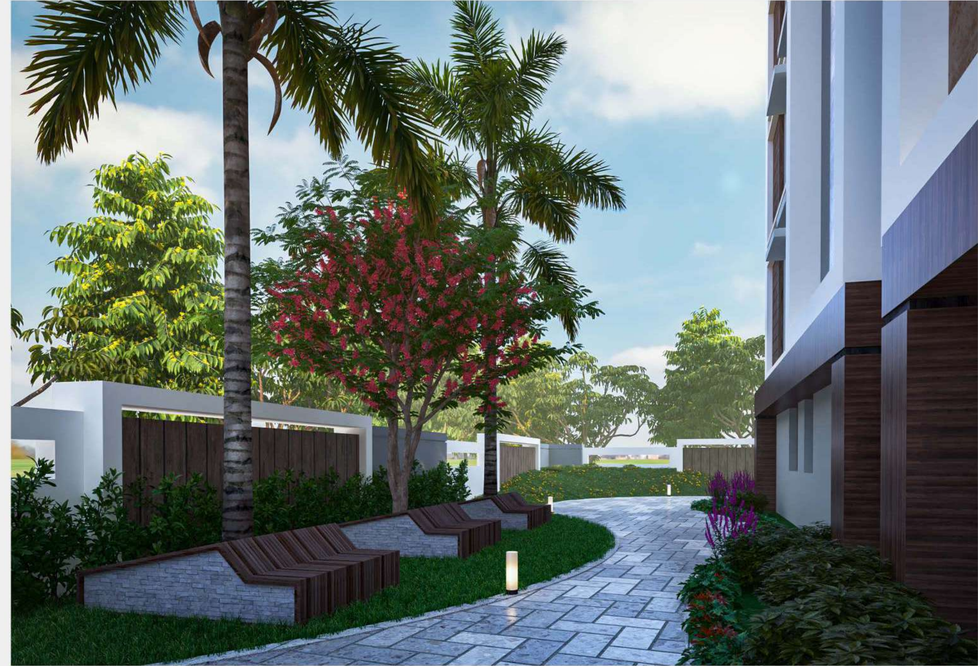
ARENA OF PLANTS WITH BRICKS

Aaditri's ELITE Luxury Gated Community Apartments