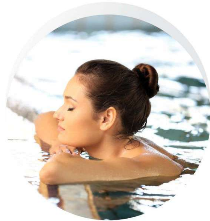
Swimming Pool & Kids poll

Our elite's list of leishures doesn't finish without a place for communion and dedicated space for physical fitness. Sweaty day is something everyone loves to have a face off with. Aditri's gymming space helps to keep you fit and healthy while you can happily live with your family. Why go elsewhere when you can freak over fitness right at home?