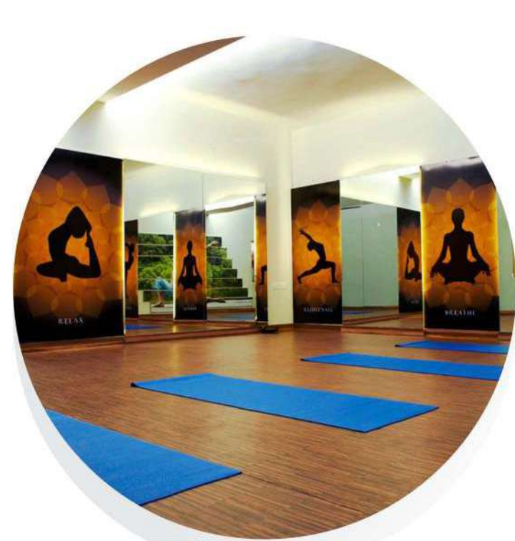
Aerobics / Yoga Hall