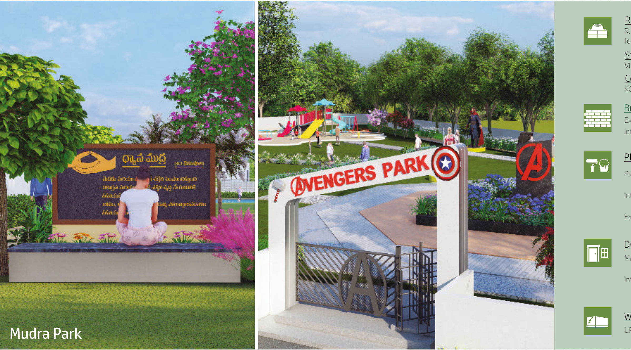
Always we are there for your Wealth along side with your Health too...

It seems like all the parks are part of larger narrative, and visitors are "recruited" to fight alongside the Avengers