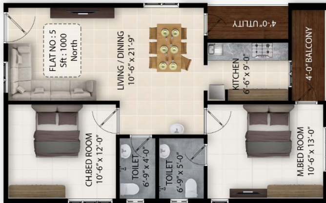
North Facing Flat #5 | Sq.ft : 1000