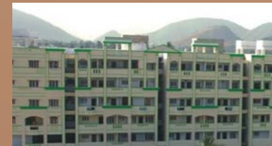
Anand Nagar Location : Madhurawada