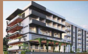
Adyssa Location : Bheemili