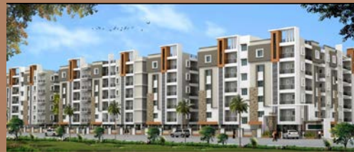
Anand Arcade Location : Madhurawada