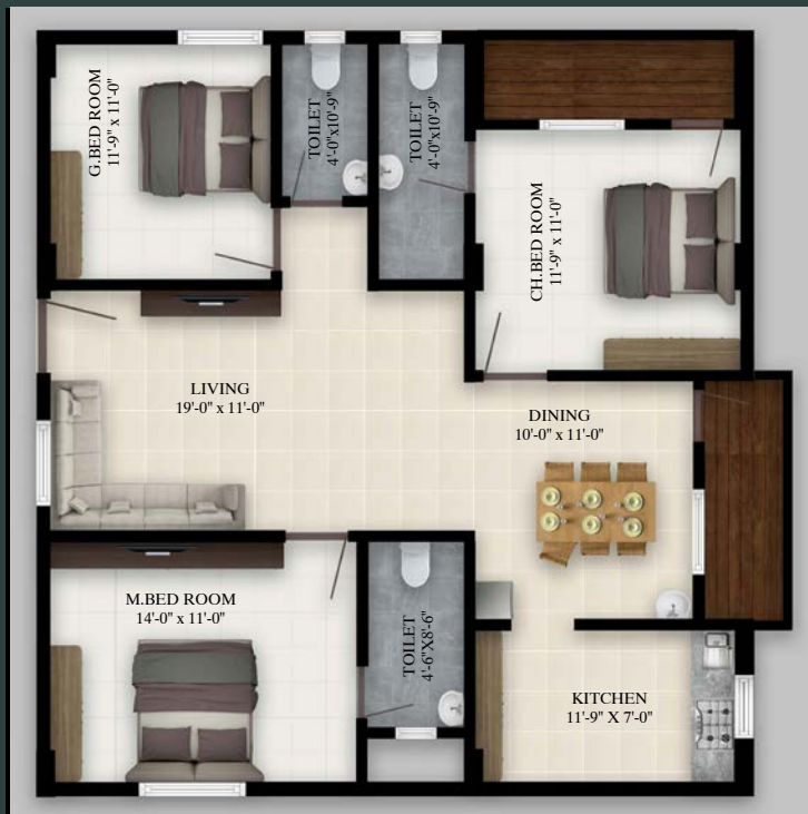
West Facing Flat #10 | Sq.ft : 1130