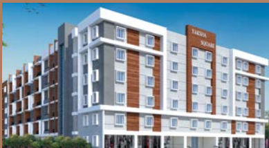
Yaksha Square Location : Boyapalem