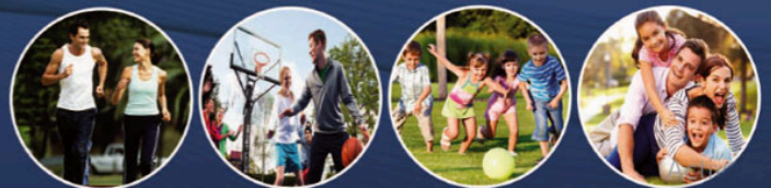
60 Feet Road Area