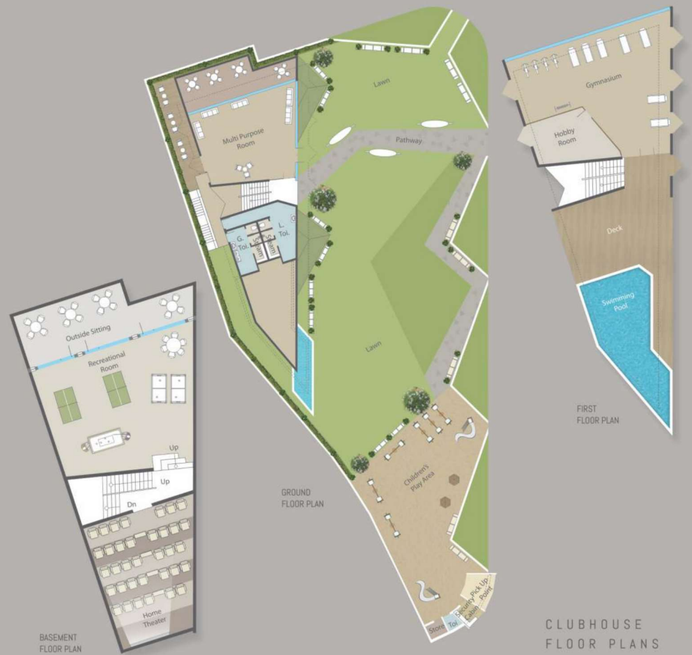
CLUBHOUSE FLOOR PLANS