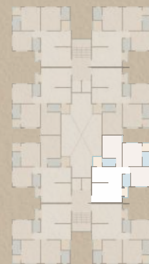
TOWER D & E TYPE - 2