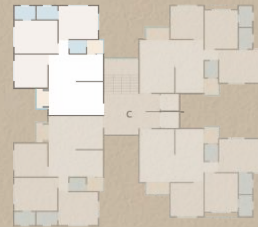
TOWER C TYPE-1