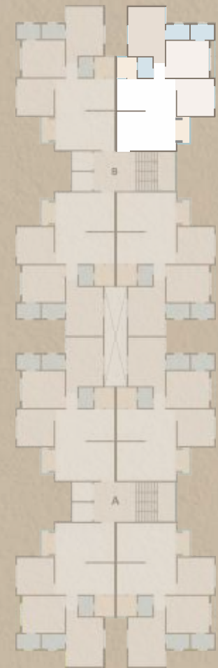
TOWER A & B