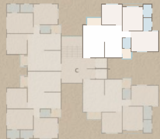
TOWER C TYPE - 2