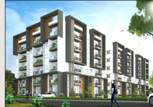
Maruthi Residency @ Maruthi Hills, Near Chandanagar, Hyderabad