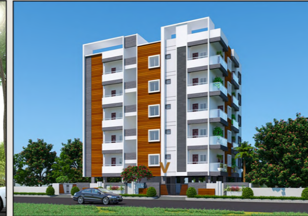
Venkatadri Residency @ Vaninagar, Near Miyapur, Hyderabad