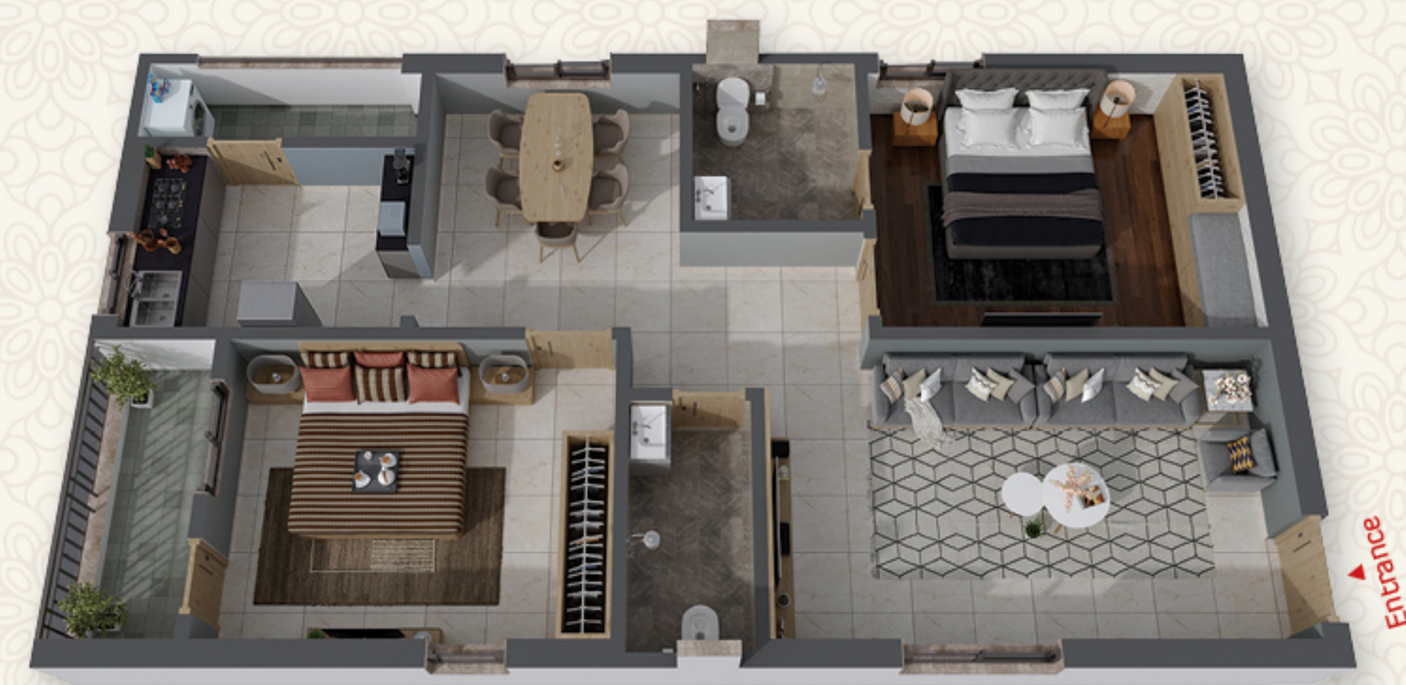
WEST-FACING 2 BHK (1100 SFT.)