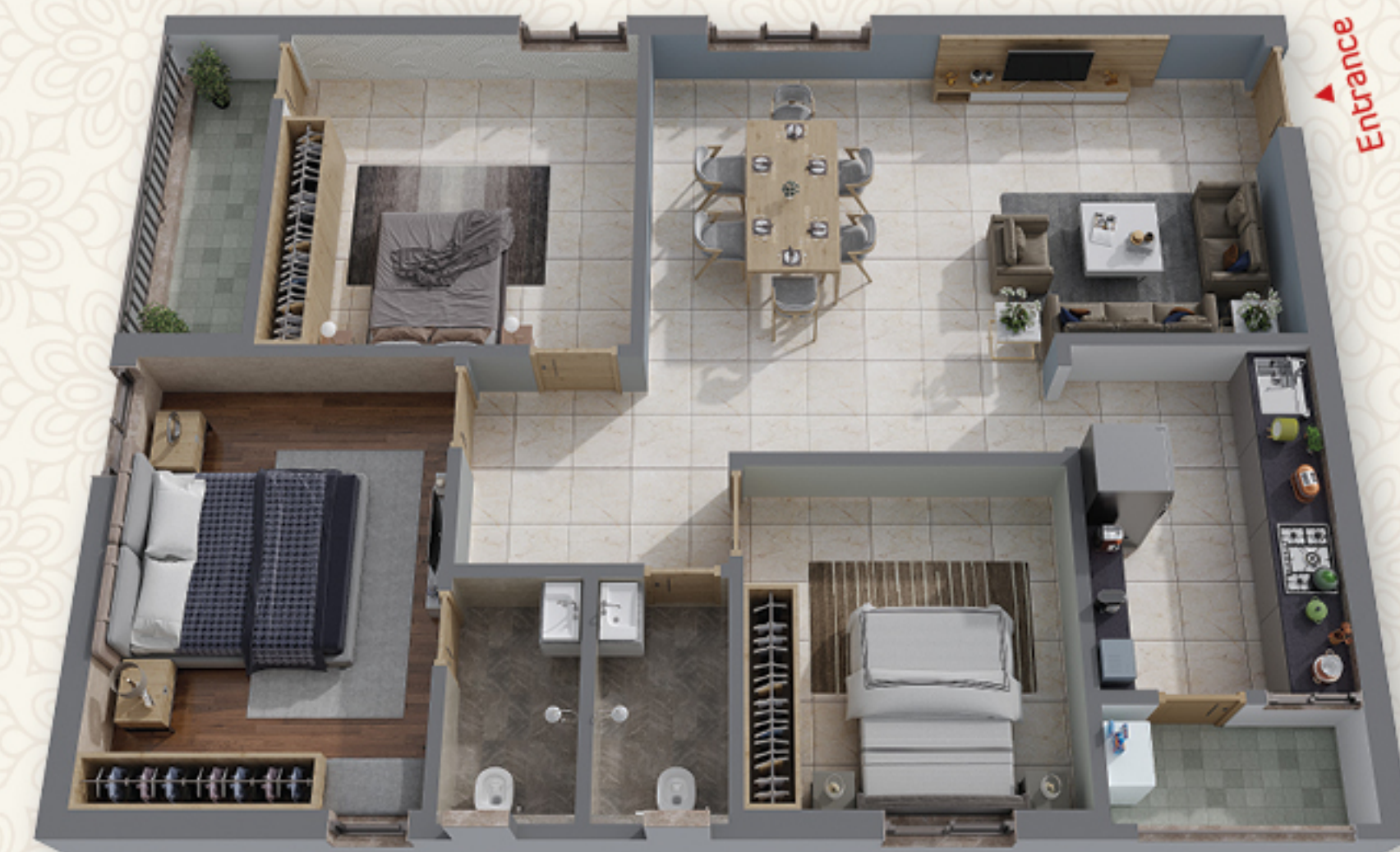
EAST-FACING 3 BHK (1460 SFT.)