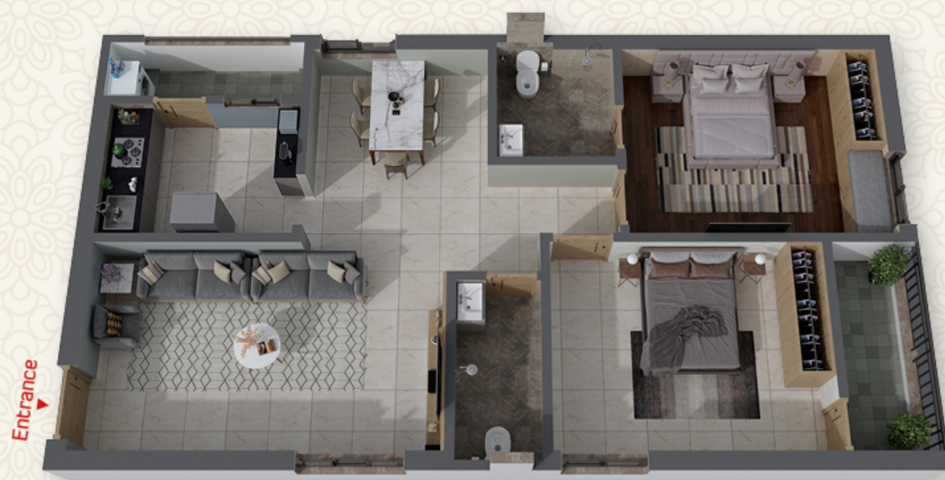
EAST-FACING 2 BHK (1100 SFT.)