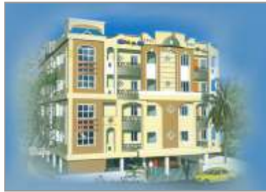
Gruhashilpi Veer Towers