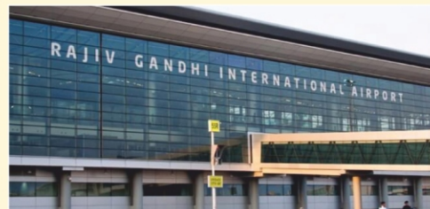
RAJIV GANDHI INTERNATIONAL AIRPORT