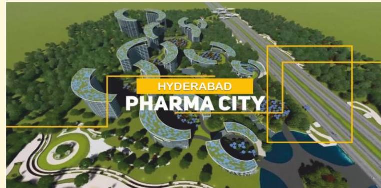
HYDERABAD PHARMA CITY