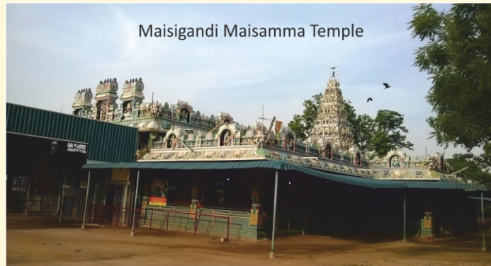
Maisigandi Maisamma Temple