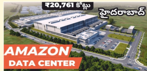
AMAZON DATA CENTER