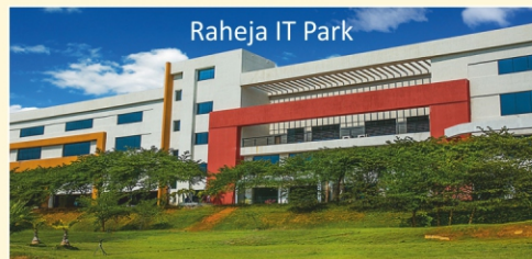
Raheja IT Park