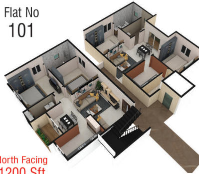
North Facing 1200 Sft