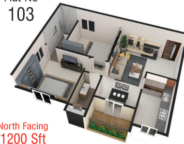
North Facing 1200 Sft