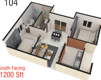
South Facing 1200 Sft