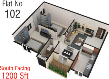
South Facing 1200 Sft