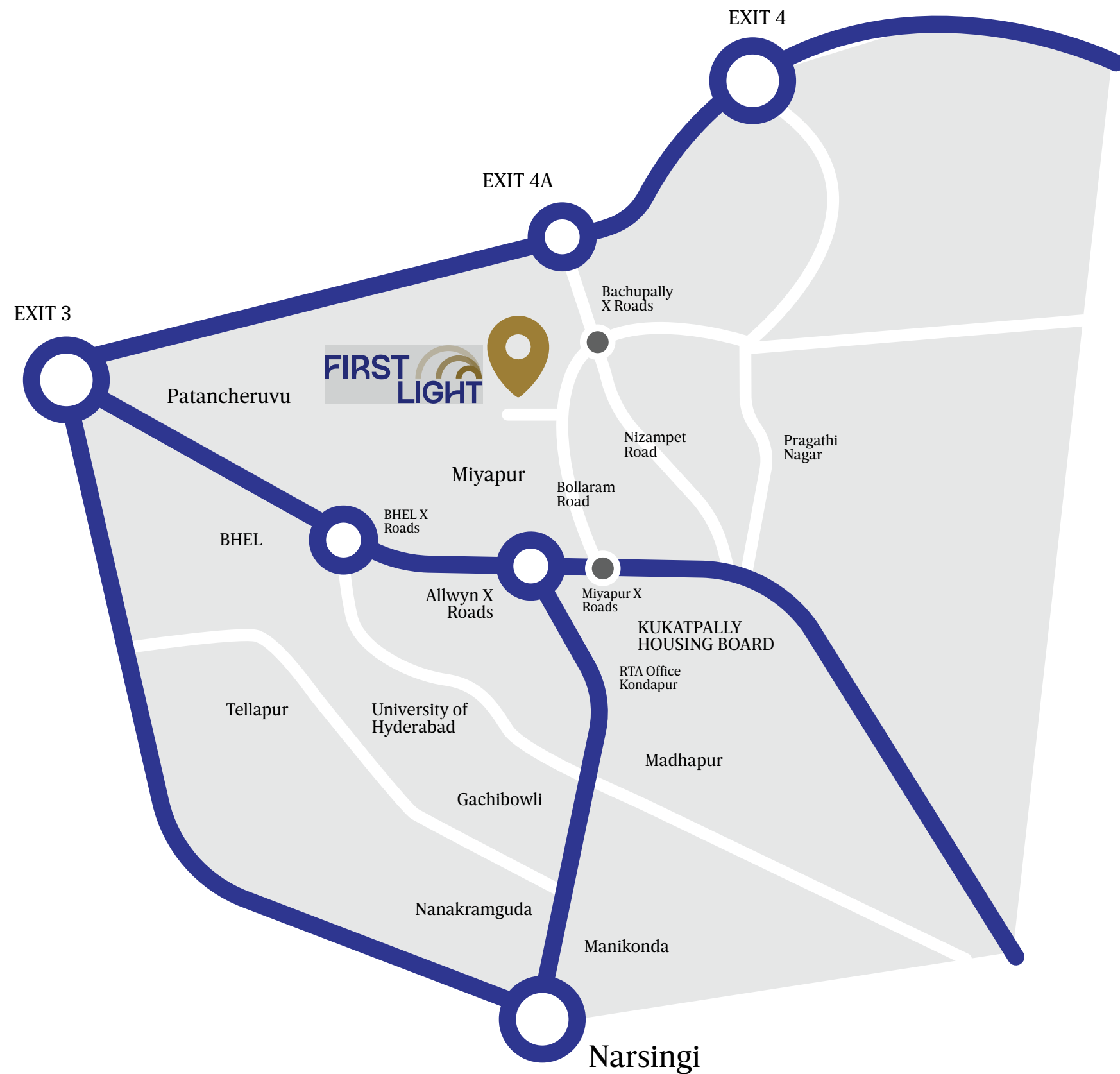
Location Map (Not for scale)

A birds-eye view above the beautiful city of Hyderabad, First Light lies on the Miyapur-Bachupally main road. Here's where you come to dull the sounds, and elevate the senses.