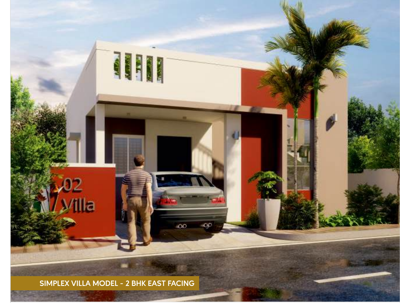
SIMPLEX VILLA MODEL - 2 BHK EAST FACING