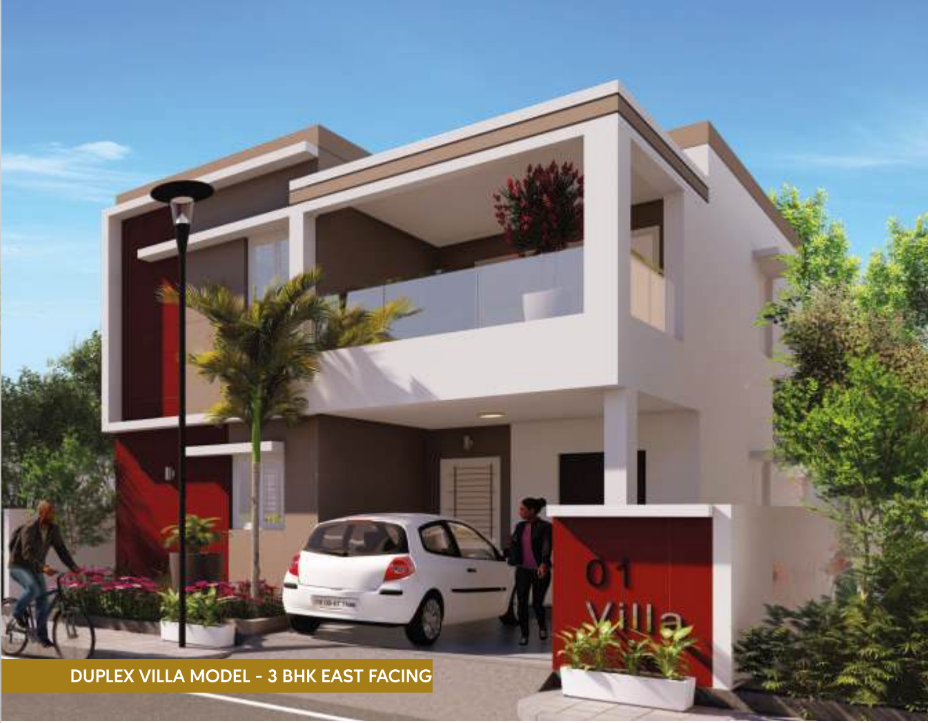
DUPLEX VILLA MODEL - 3 BHK EAST FACING