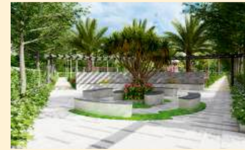
SENIOR SEATING PLAZA

Imagine waking up every morning to the melody of birdsong. You make your way to the window to gaze upon golden sunbeams dancing amongst the trees. Your eyes turn towards an undiscovered path in the woods beyond your home.