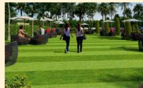
TRADITIONAL FESTIVE PARK