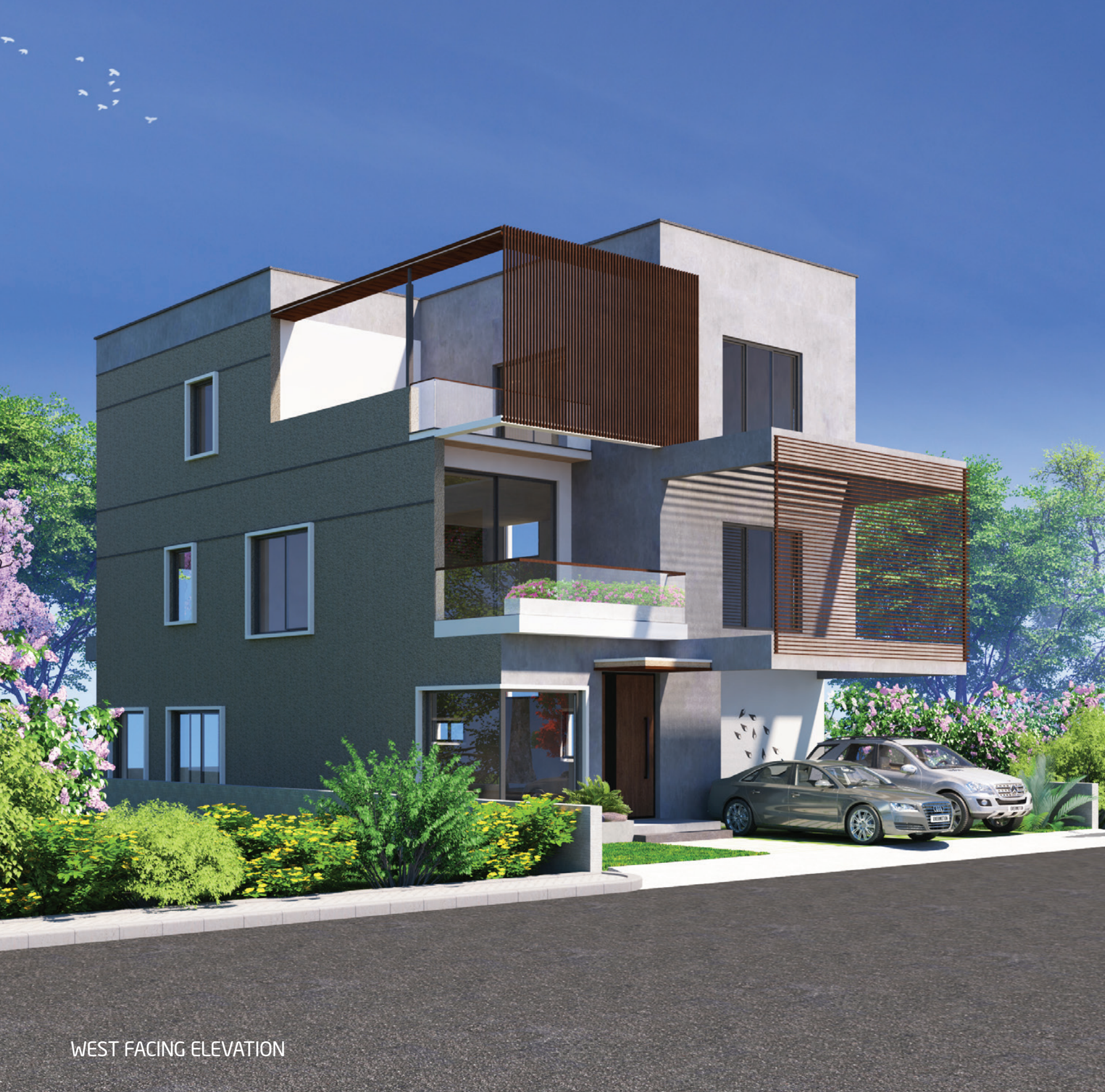
WEST FACING ELEVATION