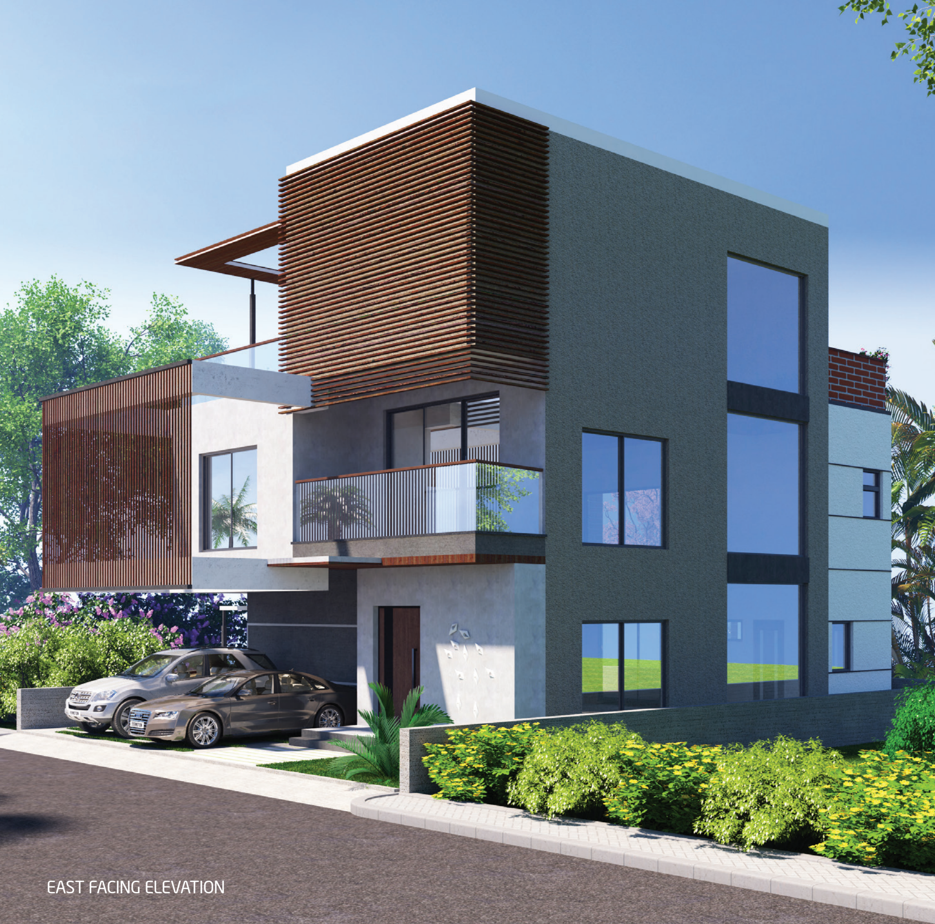
EAST FACING ELEVATION