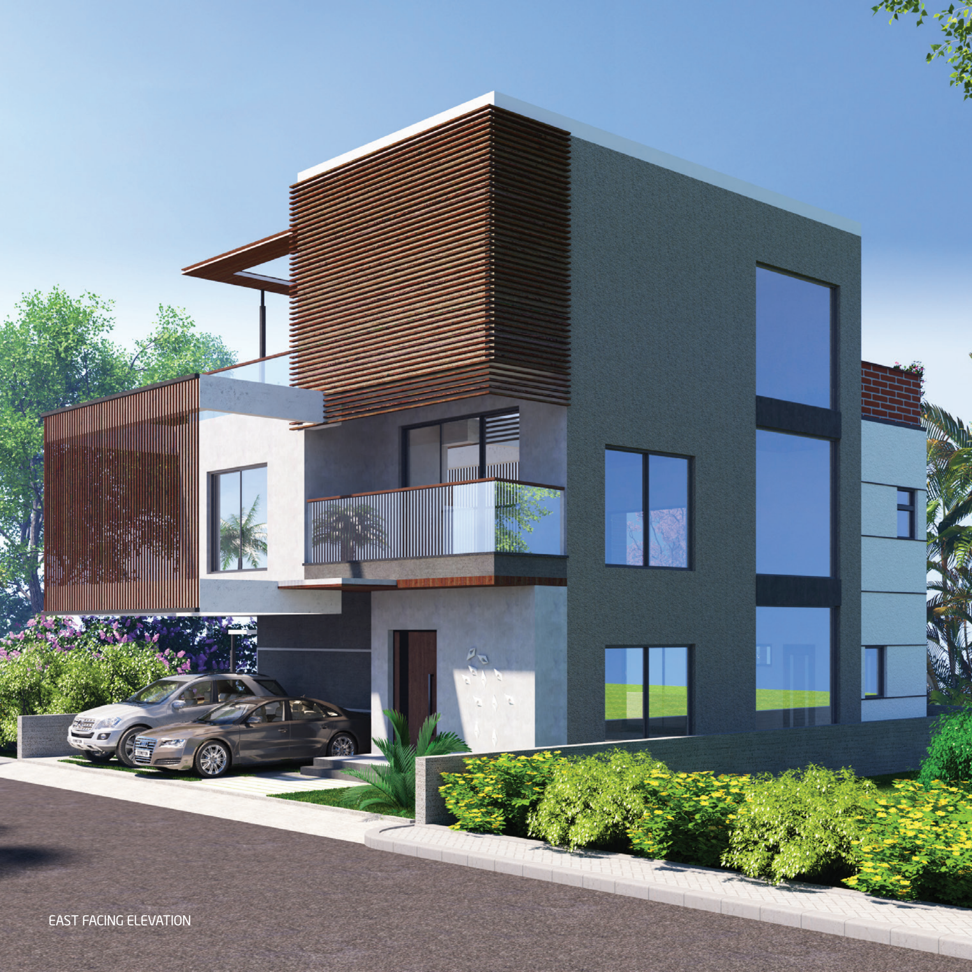
EAST FACING ELEVATION