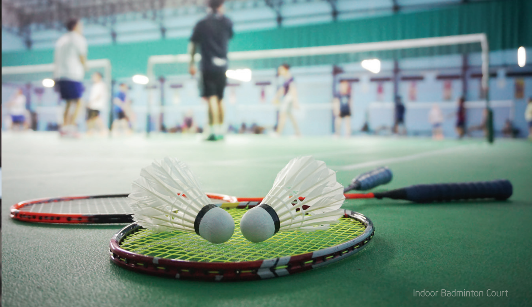
Indoor Badminton Court