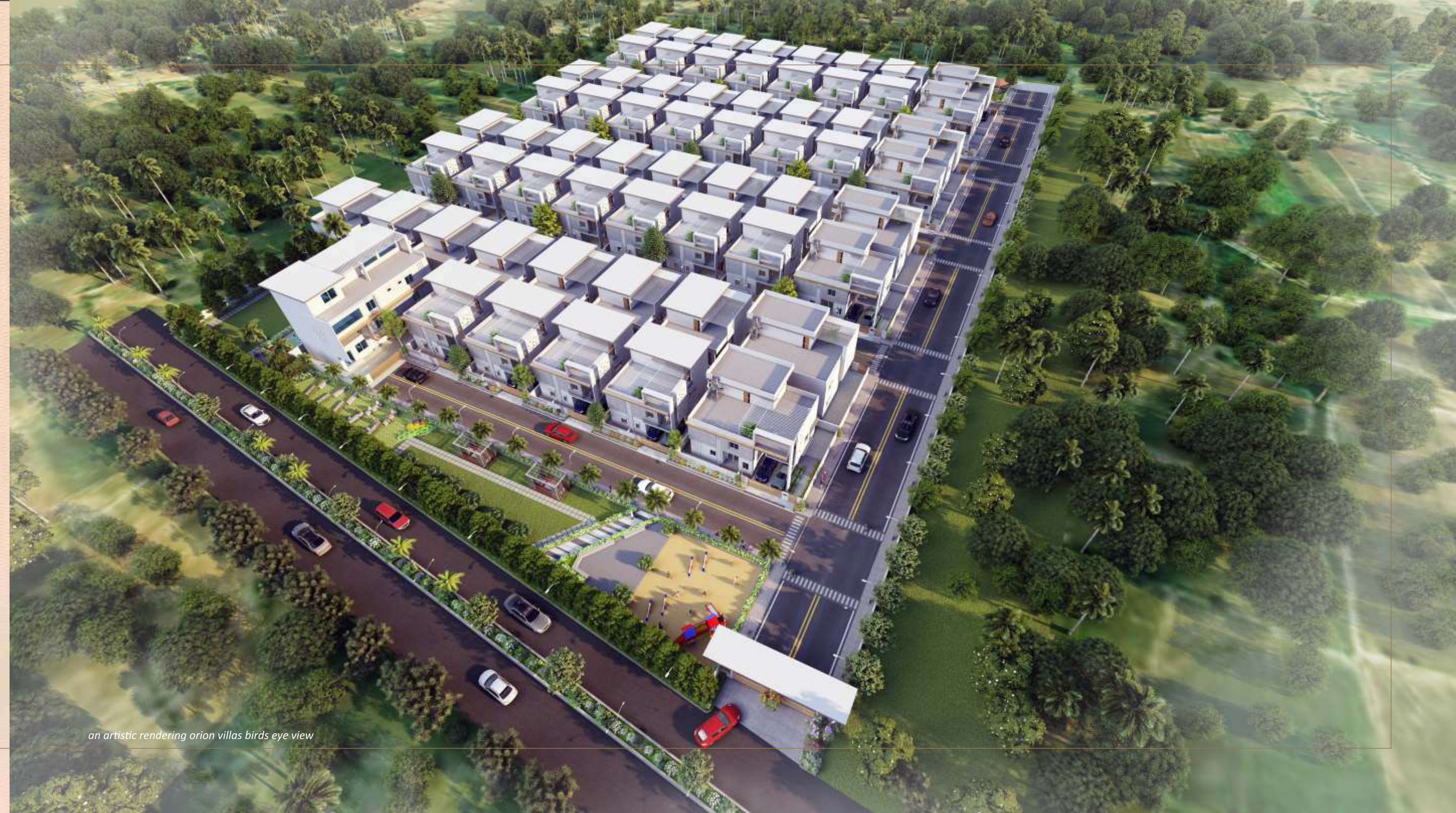
an artistic rendering orion villas birds eye view