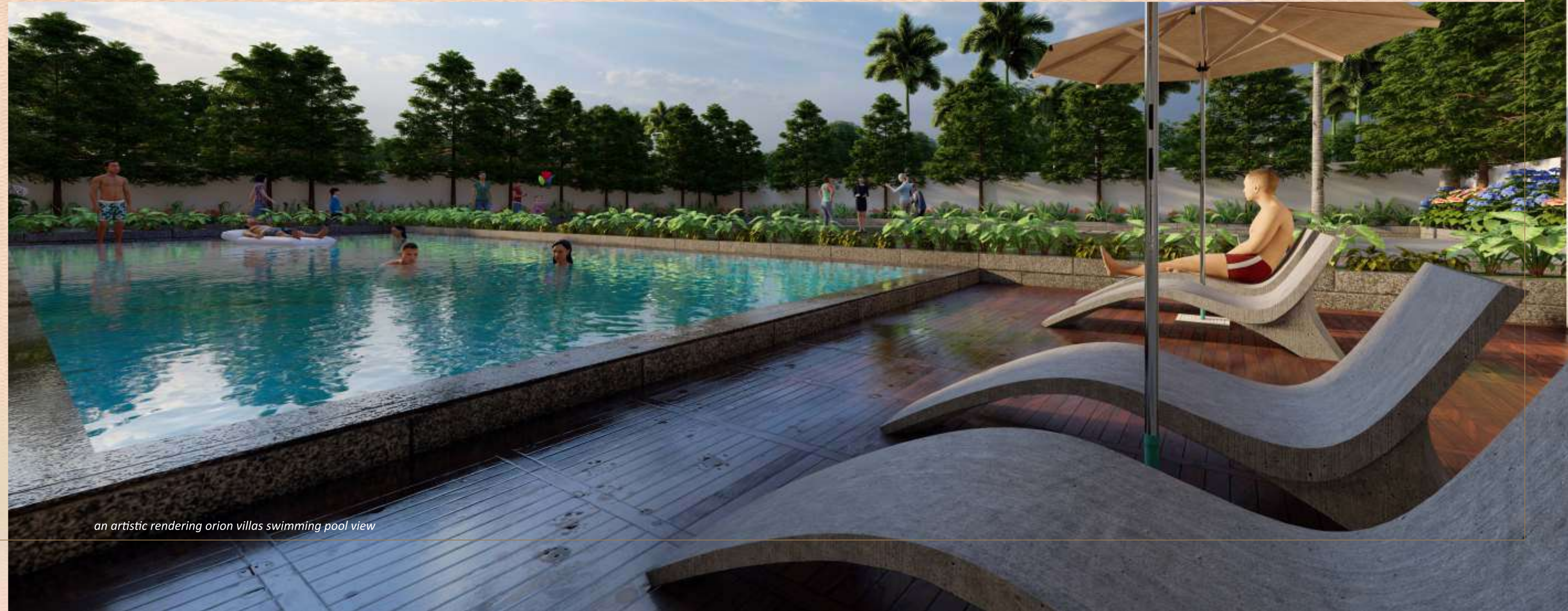
an artistic rendering orion villas swimming pool view