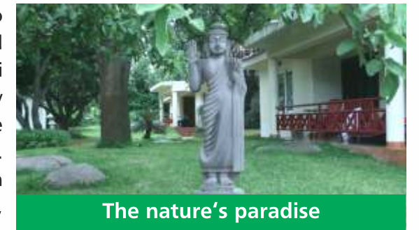
The nature's paradise

Pragati Group specialises in bringing you smart garden colonies to give relief from the ever growing urban adulterated and polluted living to provide a bio-diverse, pure living environment. Pragati has been recognised by United Nations and the global community for successfully maintaining the balance of nature to sustain the ecology at its Pragati Bio diversity Knowledge Park in Hyderabad. The park spread over 2500 acres has been transformed into a lush green, bio-diverse, self sustainable living space with 45 lac herbal, fruit and wood bearing trees based on the practices of Indian scientific traditions and sacred methodologies. The arrangement of 800 varieties of sacred herbal and heritage medicinal plantations at various pockets here called Aushadhies are Pranapradatas and Arogyapradatas. They remove toxins from the body, refresh an individual through aroma therapy and have made the area completely free from mosquitoes, bad bacteria and viruses. The flora support system has been augmented with water bodies and an innovative water supply system to reduce the temperature here 6-7 C° lesser than city levels. The zero pollution, carbon free environment here can further be substantiated by the prevailing ambient air quality standard of only 6 in Pragati as against the permissible limit of 60.