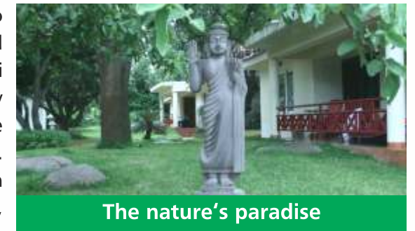
The nature's paradise

Pragati Group specialises in bringing you smart garden colonies to give relief from the ever growing urban adulterated and polluted living to provide a bio-diverse, pure living environment. Pragati has been recognised by United Nations and the global community for successfully maintaining the balance of nature to sustain the ecology at its Pragati Bio diversity Knowledge Park in Hyderabad. The park spread over 2500 acres has been transformed into a lush green, bio-diverse, self sustainable living space with 45 lac herbal, fruit and wood bearing trees based on the practices of Indian scientific traditions and sacred methodologies. The arrangement of 800 varieties of sacred herbal and heritage medicinal plantations at various pockets here called Aushadhies are Pranapradatas and Arogyapradatas. They remove toxins from the body, refresh an individual through aroma therapy and have made the area completely free from mosquitoes, bad bacteria and viruses. The flora support system has been augmented with water bodies and an innovative water supply system to reduce the temperature here 6-7 C° lesser than city levels. The zero pollution, carbon free environment here can further be substantiated by the prevailing ambient air quality standard of only 6 in Pragati as against the permissible limit of 60.