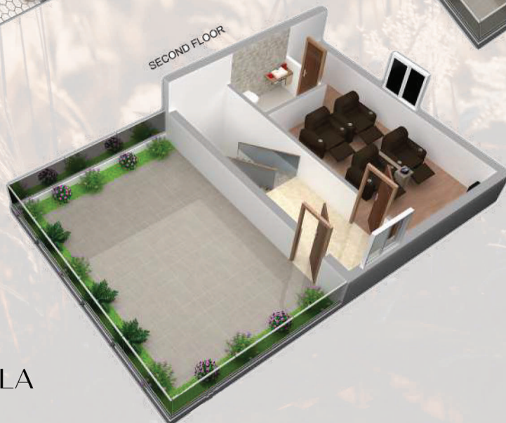
EAST FACING VILLA