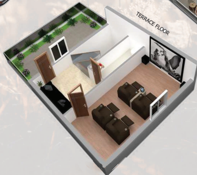
WEST FACING VILLA