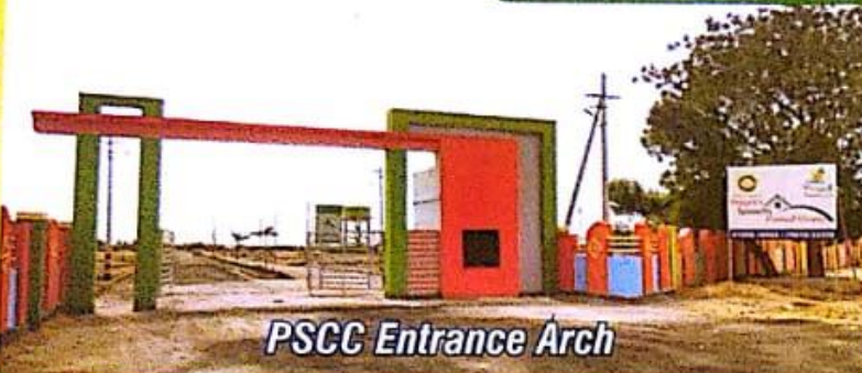
PSCC Entrance Arch