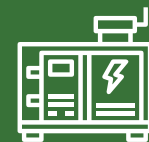
24X7 Power Back-up