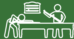
Indoor Games Room 765 sft.