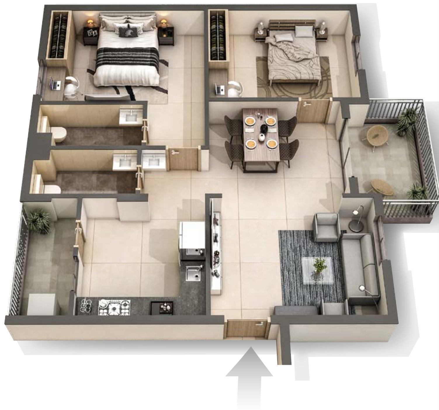
Flat 5 East Facing