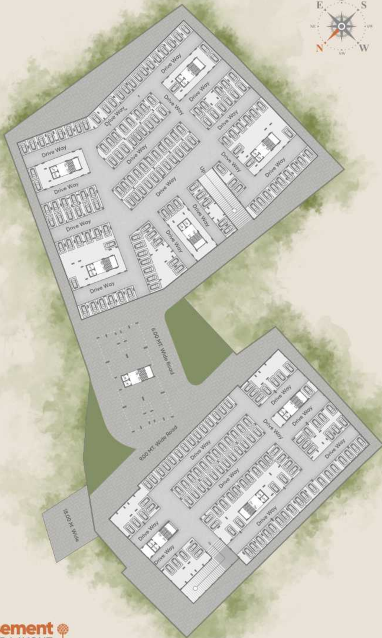
Basement FLOOR LAYOUT