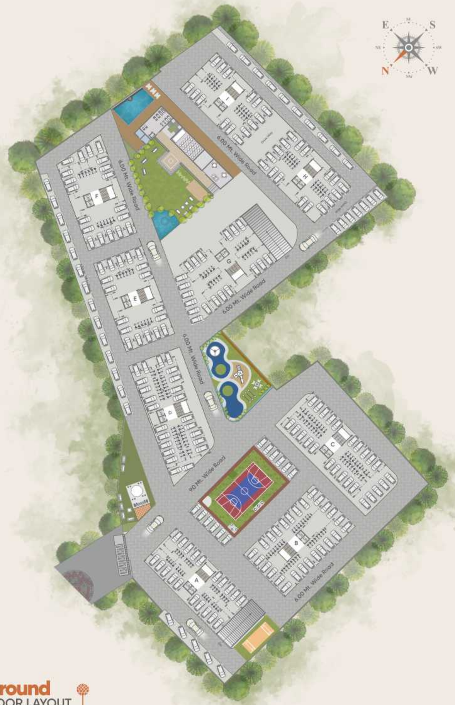
Ground FLOOR LAYOUT