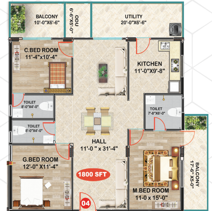
West Face 3 BHK 1800 SFT