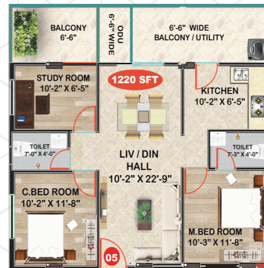
West Face 2.5 BHK 1220 SFT