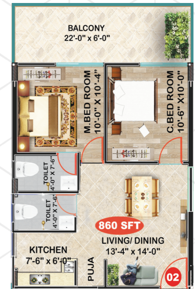
East Face 2 BHK 860 SFT