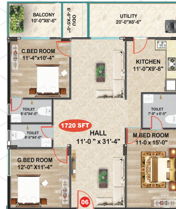
West Face 3 BHK 1720 SFT