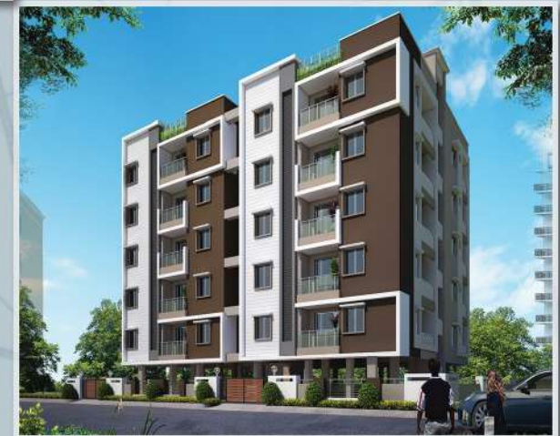
Meadows @Alkapur township, Neknampur