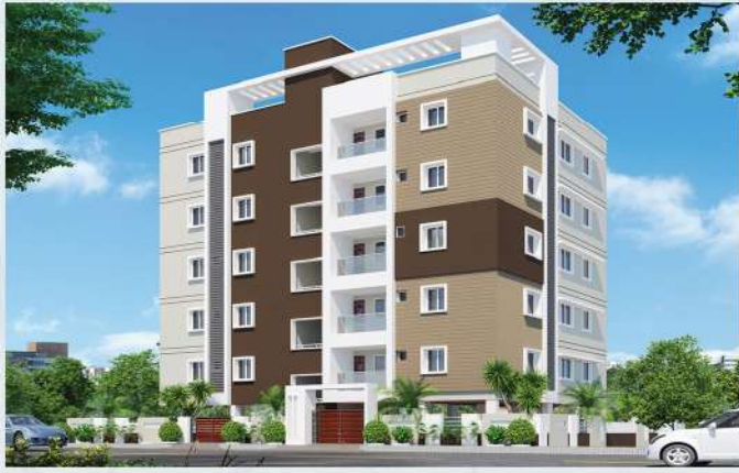
Morning Glory @ EVV Colony Neknampur