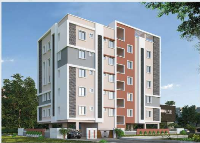
Ivory Grand @ Marwa Township Narsingi