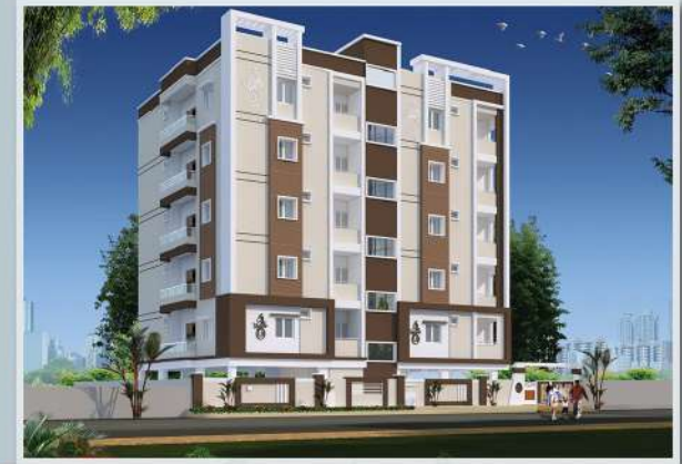
Veda @ Alkapur township, Neknampur