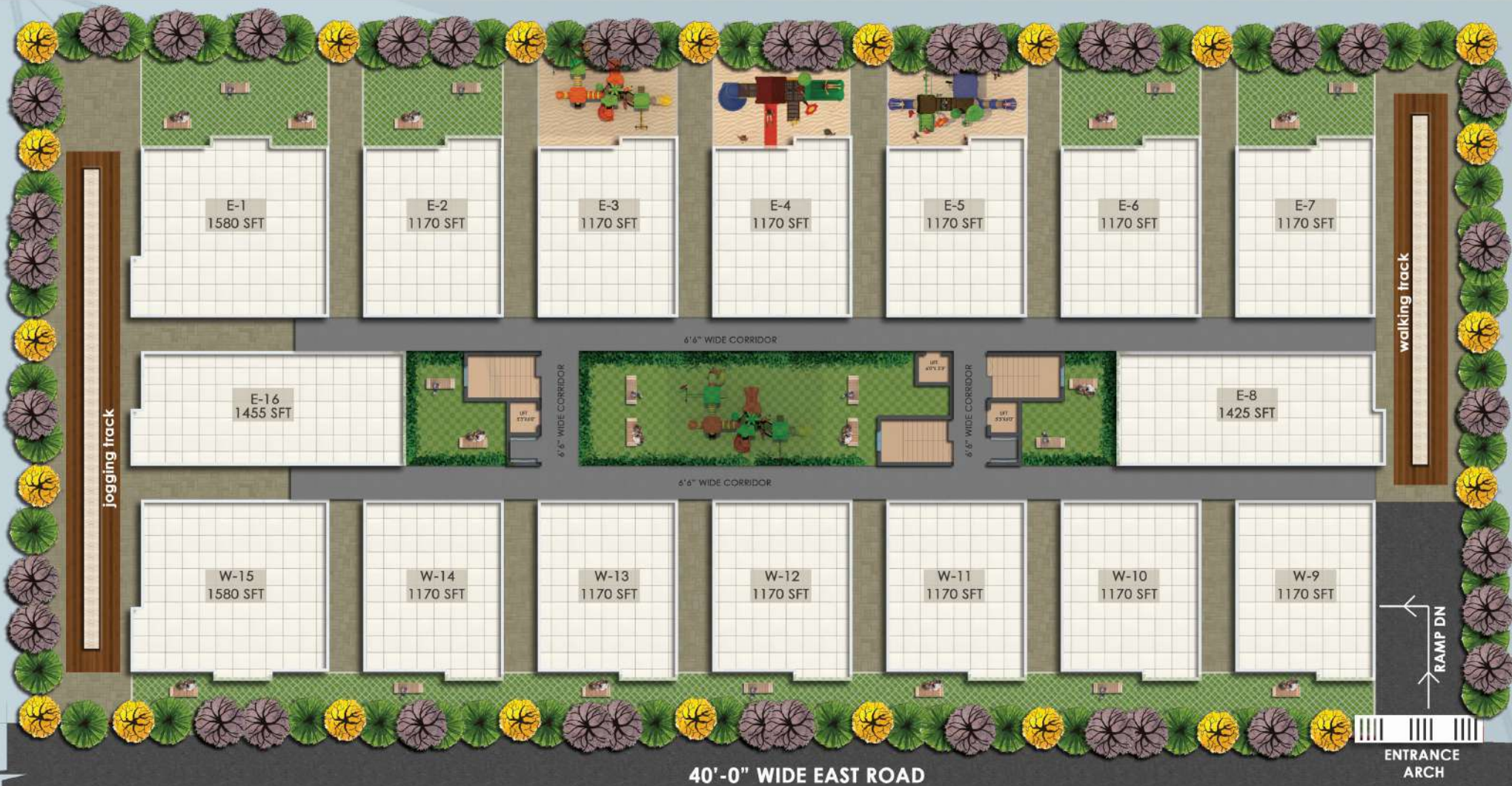
MASTER PLAN LAYOUT