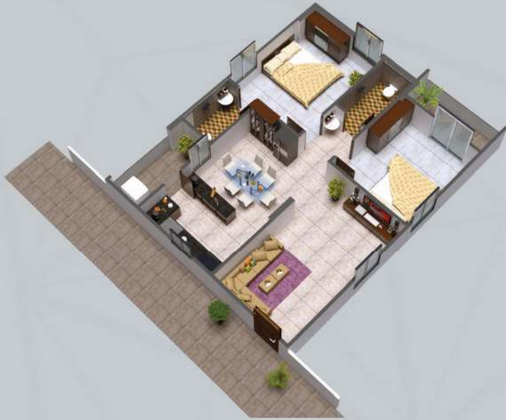
EAST 1170 SFT