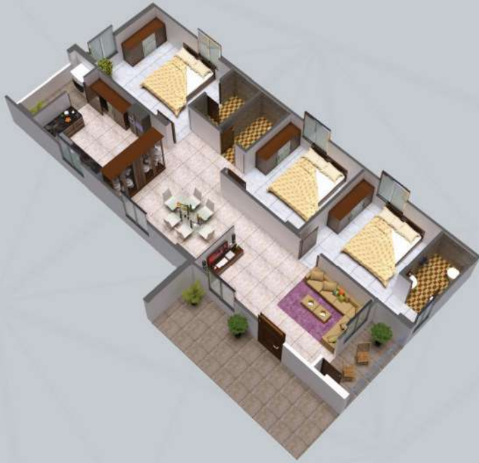
EAST 1455 SFT