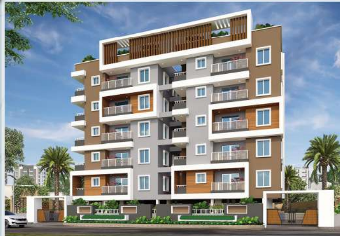
Sri Dhanvi @Alkapur township, Neknampur (On Going)