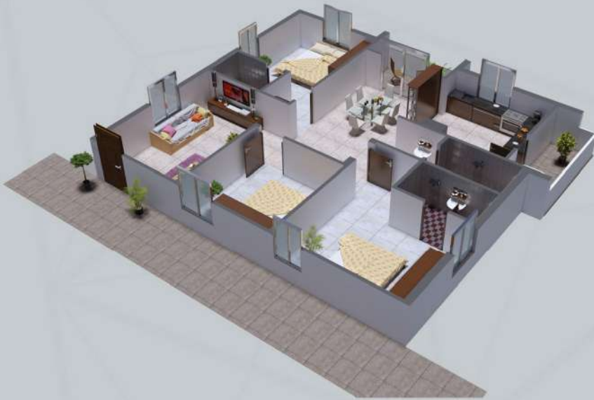
3BHK WEST 1580 SFT