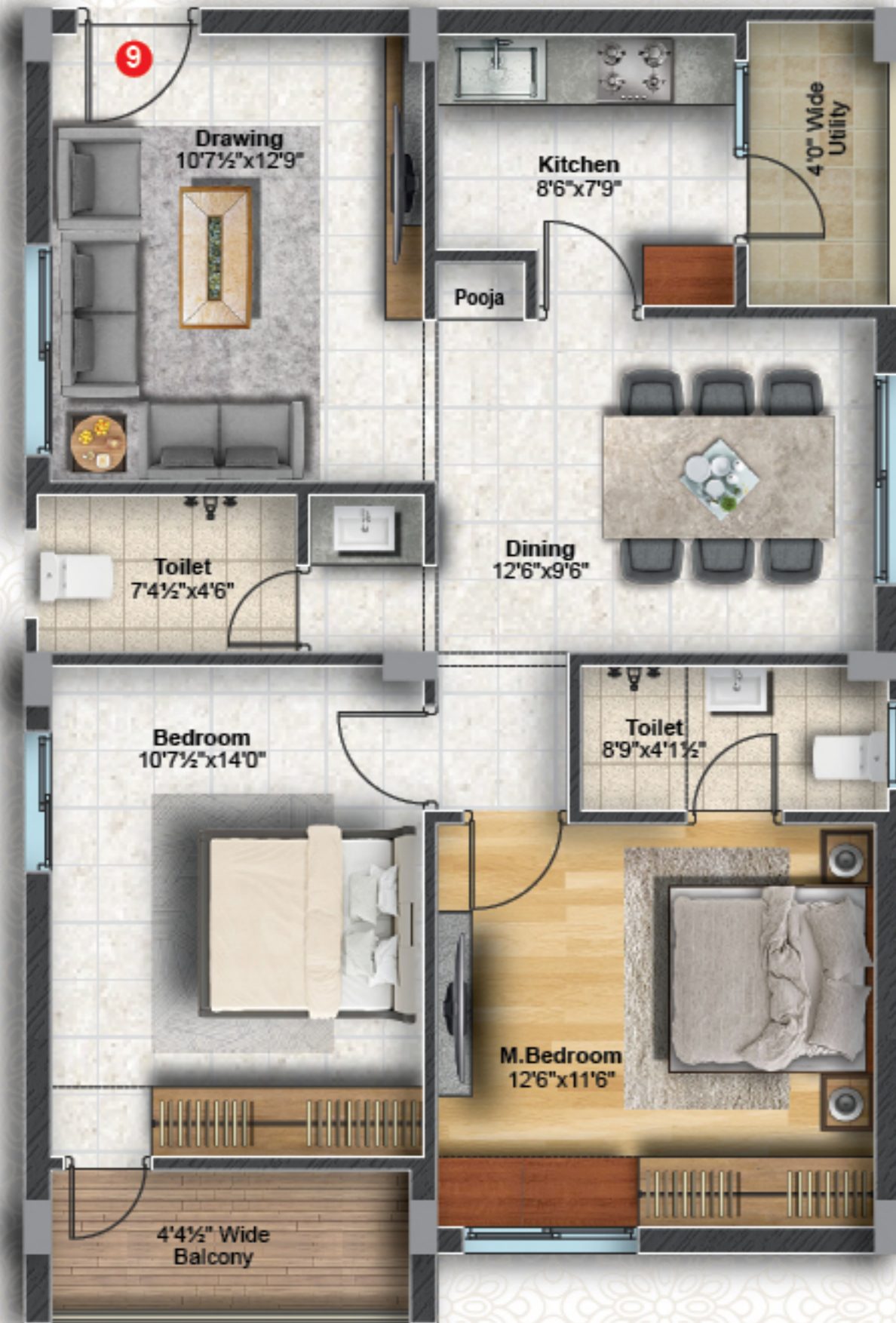
2 BHK 2D VIEW EAST FACING FLAT NO. C-9

Kowsalya Manidweepam is a residential creation designed to be a communion of 3 BHK and 2 BHK flats with a whole lot of space and conveniences that come with immense planning. The 2 BHK flat area is of 1184 sft. We have ensured that all the flats and the entire community are designed according to Vaasthu without deviating from its principles. All in all, it has been designed to help the dwellers benefit from the wonderful living conditions it offers.