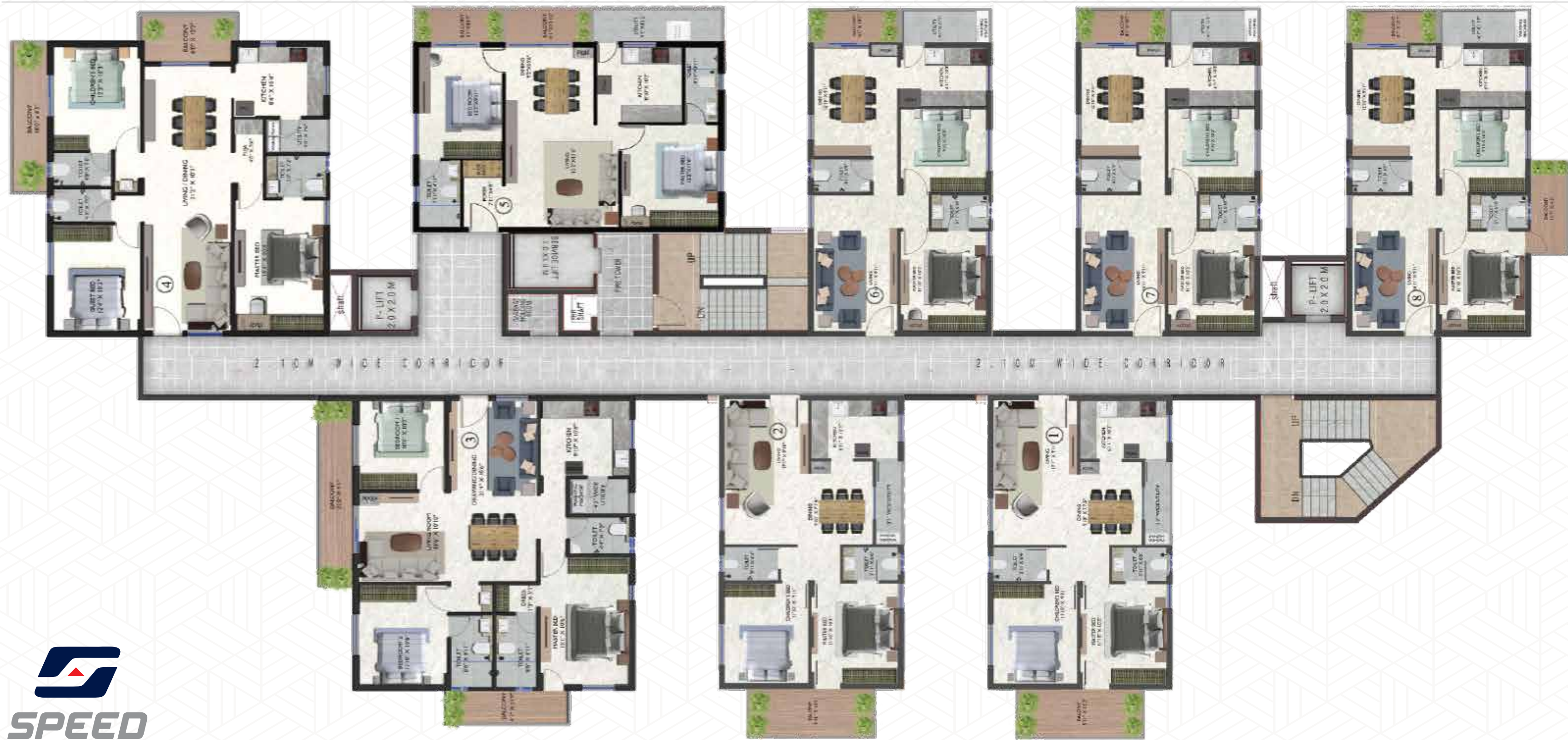
TYPICAL FLOOR PLAN A-BLOCK