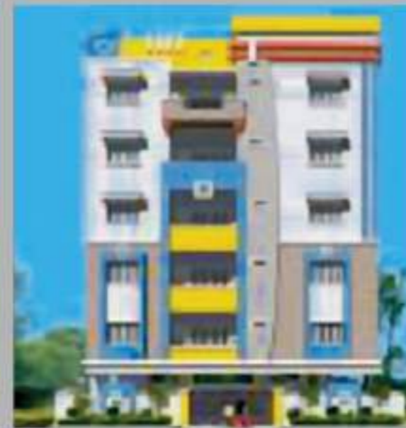
Shanta Shankar Residency