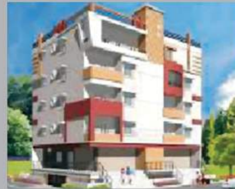
Sri Sai Tripura Residency

Landmark III is a creation of Tripura Constructions, an entity that has created several landmarks that you'll be impressed. With an experience of over two decades, here comes yet another home that has behind it a proven legacy of several successful edifices. Tripura has created a plethora of homes – from large gated-communities to independent houses across the twin-cities. Come be hosted here.