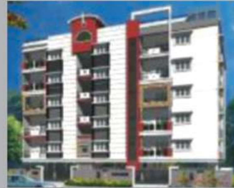
Sri Balaji Residency