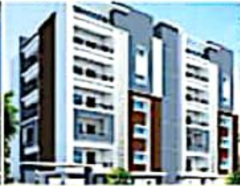
Maruthi Heights @ BDL colony