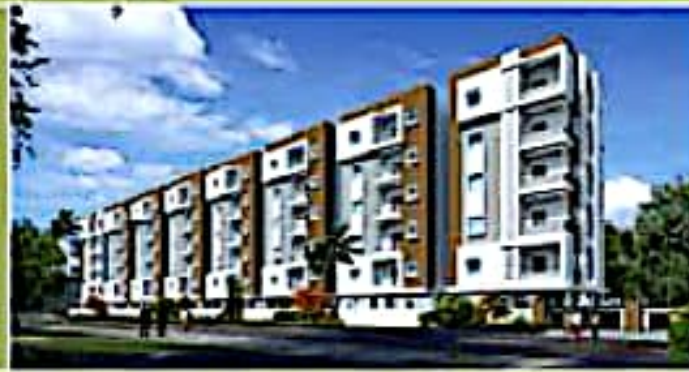
Maruthi Heavens @ Sainikpuri