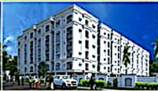
Quality Signature @ Alwal