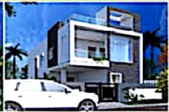
Maruthi Villas @ Kapra