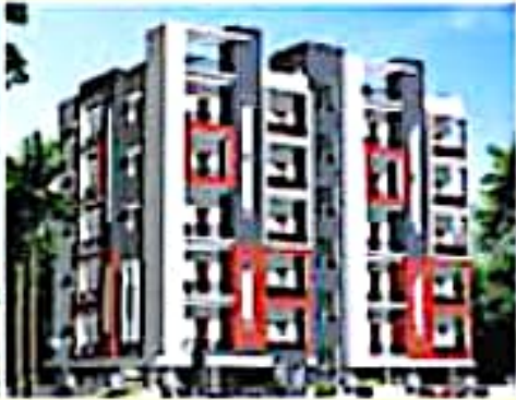
Maruthi Pearl @ Defence colony