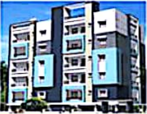
Maruthi Elite @ Kapra