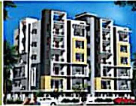
Maruthi Pride @ Defence colony