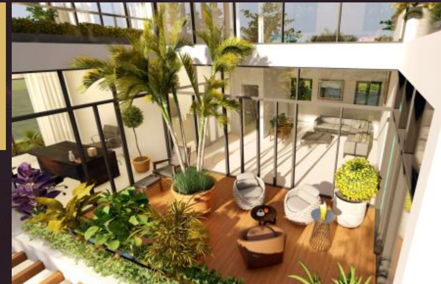
Central Courtyard with Open Terraces for Outdoor Living and Entertaining

A Central Courtyard that Exudes Elegance