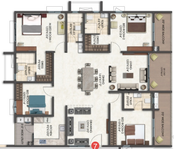
4 BHK - EAST 2751 Sft.