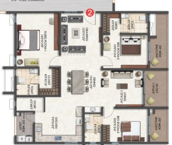
3 BHK - WEST 2358 Sft.