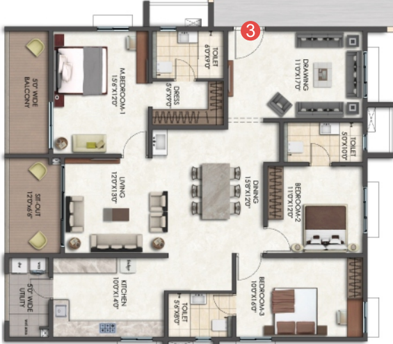
3 BHK - WEST 2358 Sft.