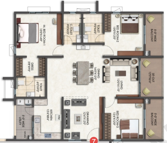
3 BHK - EAST 2358 Sft.