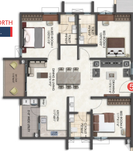
3 BHK - NORTH 1733 Sft.