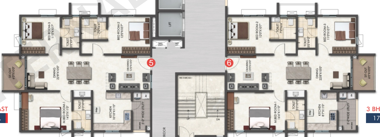
3 BHK - WEST 1733 Sft.