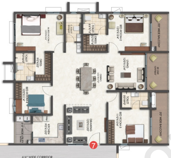
4 BHK - EAST 2751 Sft.