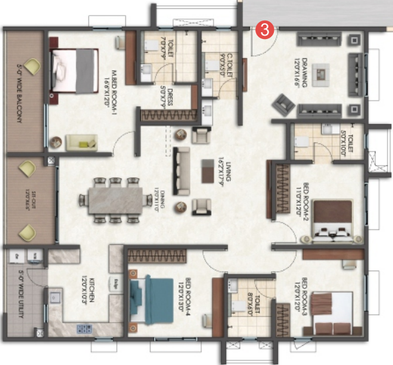
4 BHK - WEST 2751 Sft.