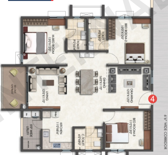
3 BHK - NORTH 1938 Sft.