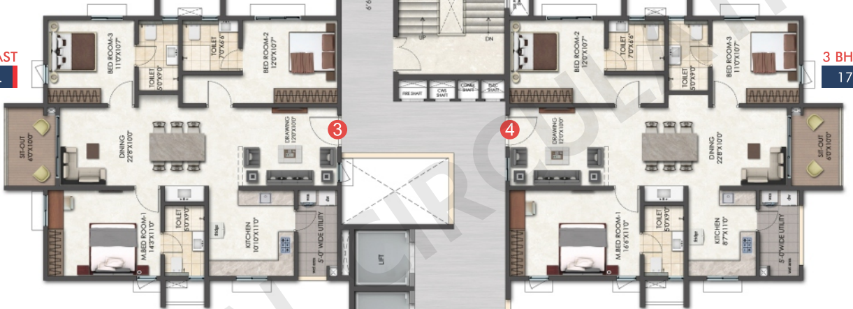
3 BHK - EAST 1733 Sft.