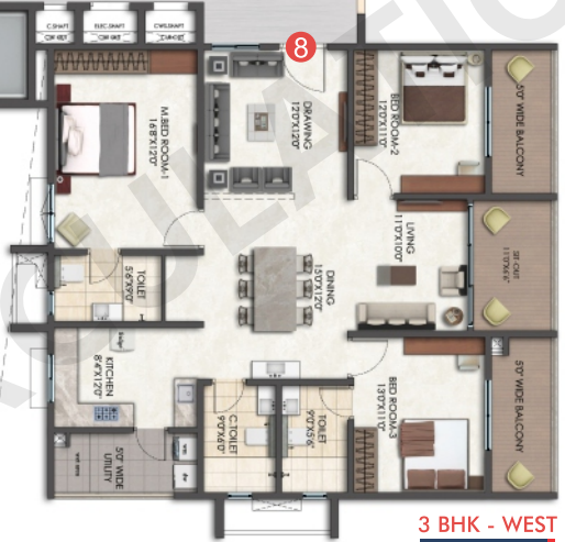
3 BHK - WEST 2119 Sft.