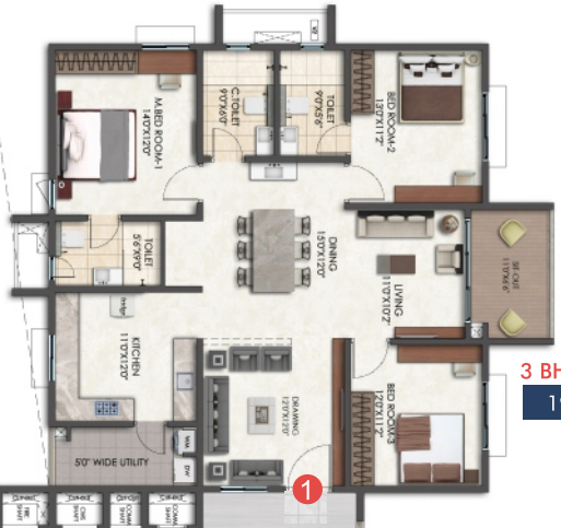
3 BHK - EAST 1938 Sft.