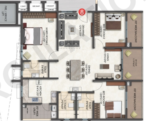
3 BHK - WEST 2119 Sft.