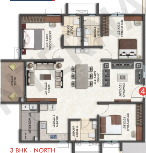
3 BHK - NORTH 1938 Sft.