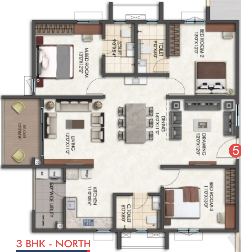
3 BHK - NORTH 1938 Sft.