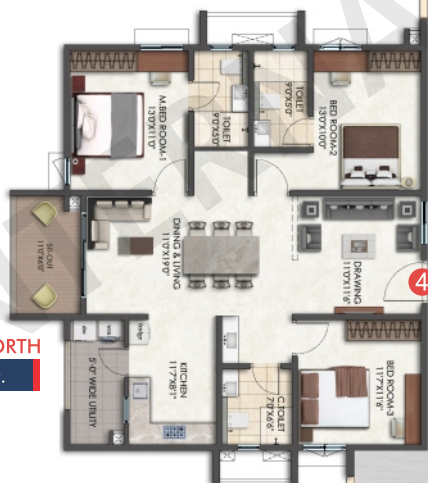
3 BHK - NORTH 1733 Sft.