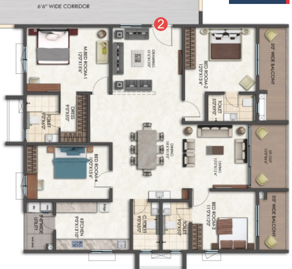
4 BHK - WEST 2751 Sft.