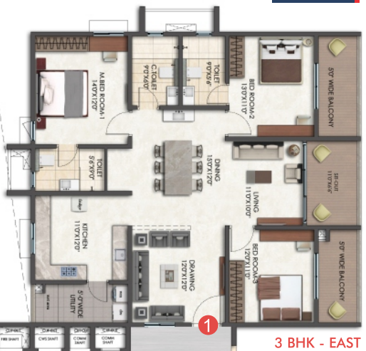
3 BHK - EAST 2119 Sft.