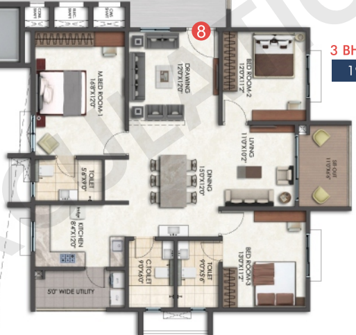
3 BHK - WEST 1938 Sft.