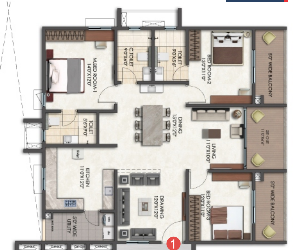
3 BHK - EAST 2119 Sft.