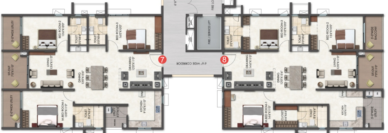
3 BHK - EAST 2113 Sft.