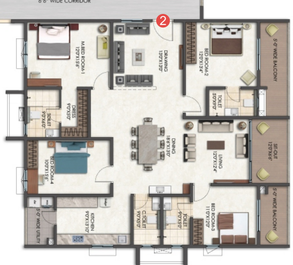
4 BHK - WEST 2751 Sft.