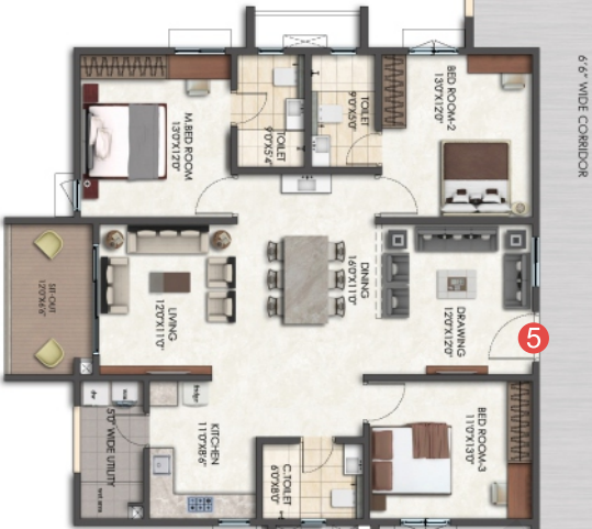
3 BHK - NORTH 1938 Sft.