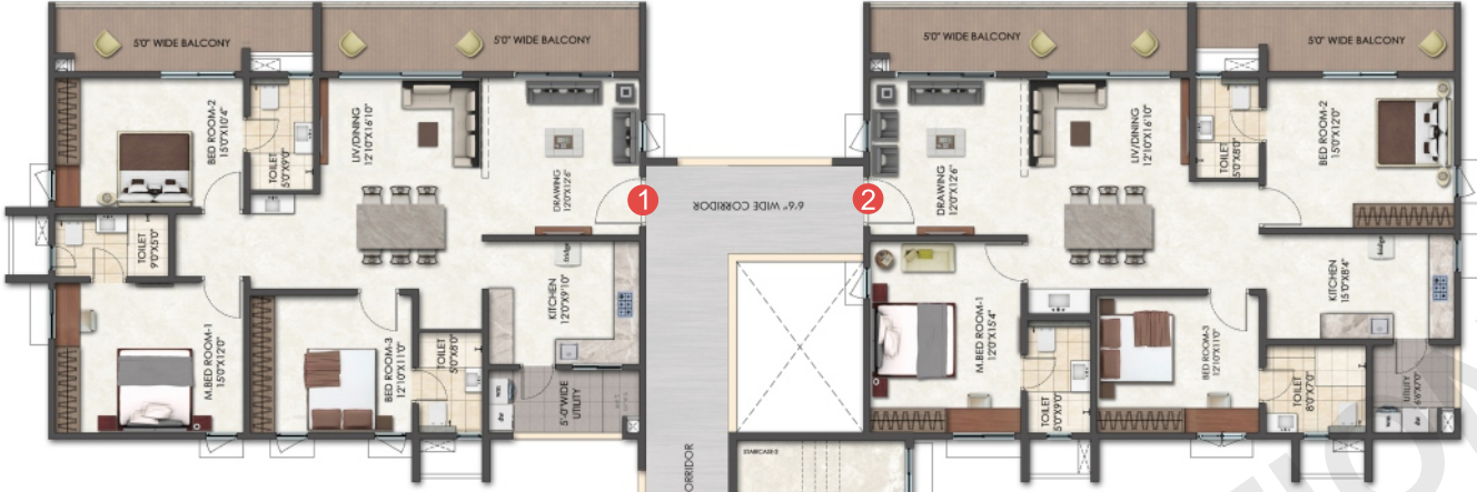
3 BHK - EAST 1733 Sft.