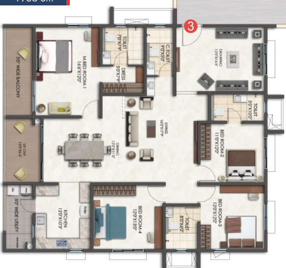
4 BHK - WEST 2751 Sft.