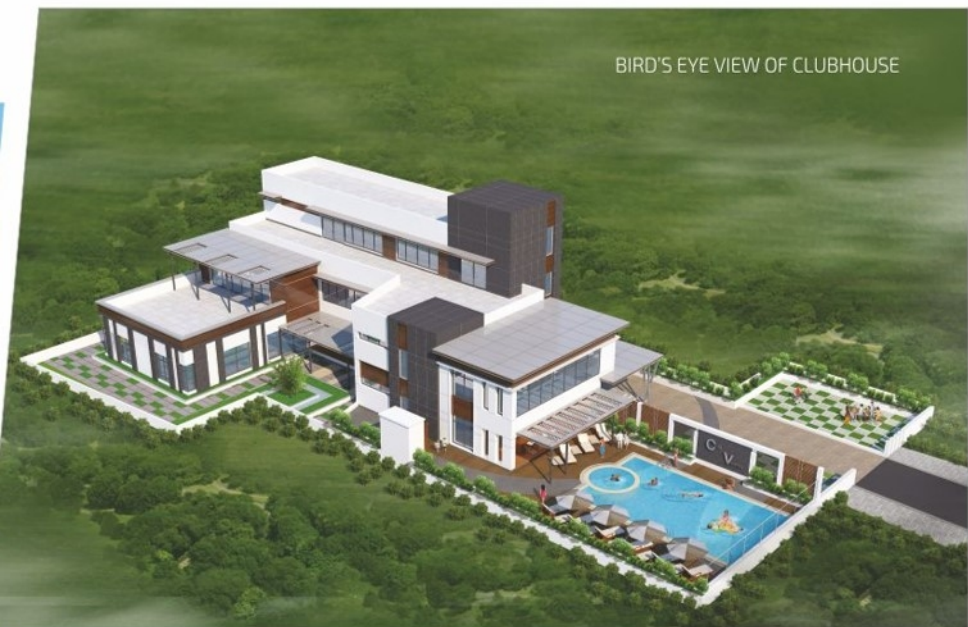
BIRD'S EYE VIEW OF CLUBHOUSE