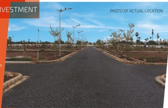
PHOTO OF ACTUAL LOCATION