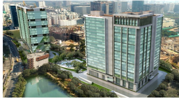
BSR TECH PARK 2 at Financial District, Nanakramguda