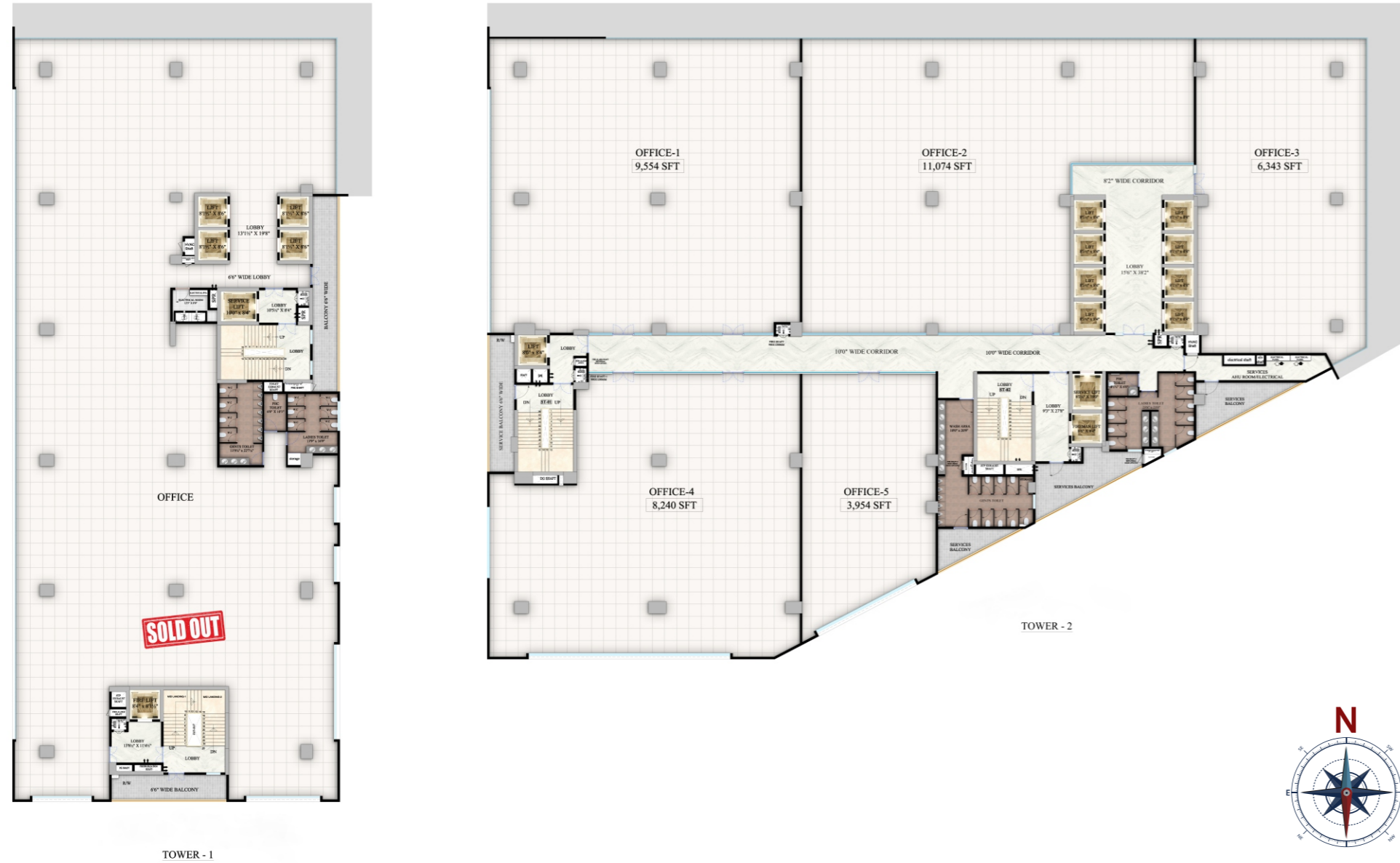
Typical Floor Plan (Multiple Units)