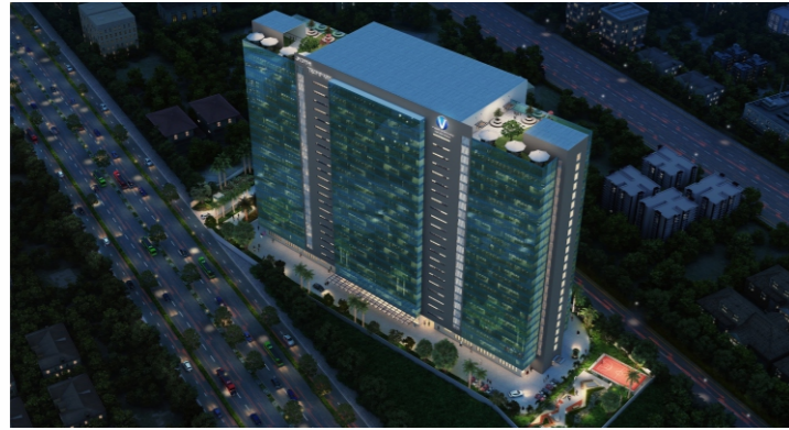
JYOTHI TECH PARK at Financial District