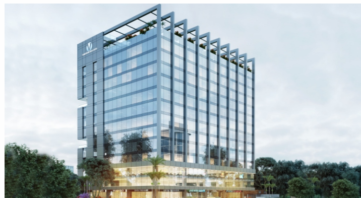
Vamsiram New Project at Gandipet