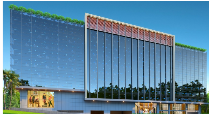
BSR ONE at Road No. 2, Banjara Hills