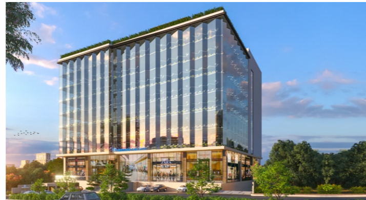
JYOTHI VALENCIA at Road No. 2, Banjara Hills