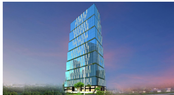
VSD TECH PARK at Financial District