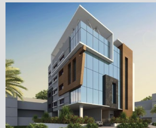
Commercial-D.S. Meridian, Gachibowli, Hyderabad