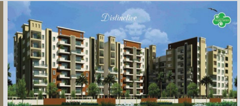
Hanging Gardens, Bangalore