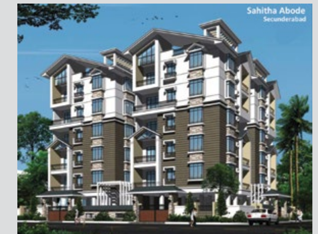
Sahitha Abode, Secunderabad