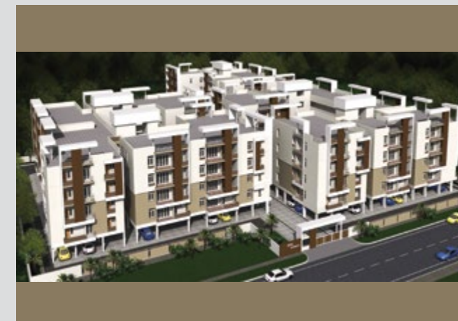
Kens Residency, Bangalore