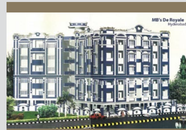
MB'S De Royale, Hyderabad