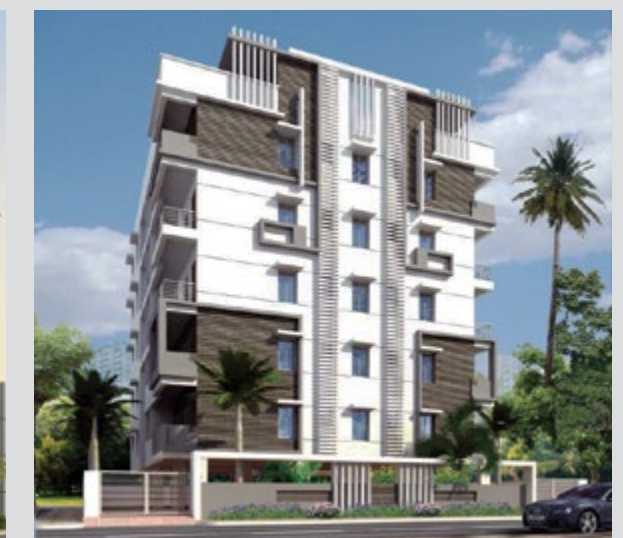
Splendour Park, Hyderabad

Note: GST, Registration, Car Parking, APSEB & Municipal water charges will be charged extra.