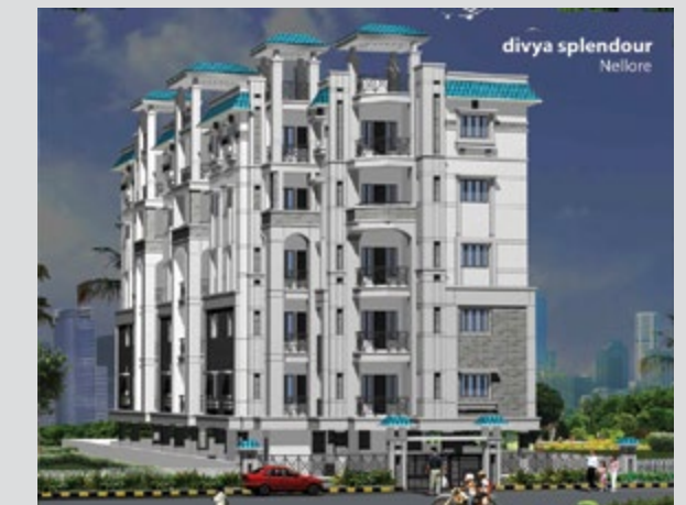
Divya Splendour, Nellore