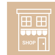
D-MART 2.5 KM