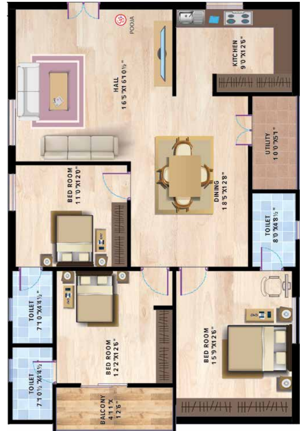
IMPERIA - I 3BHK - EAST FACE