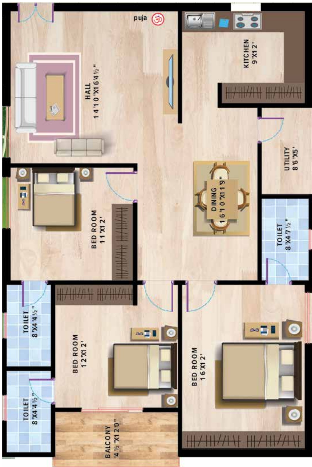
IMPERIA - II BLOCK-2 3BHK - EAST FACE FLAT NO 3 & 4