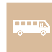
BUS COMPLEX 13 KM