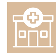
CAPITAL HOSPITALS 3.0 KM

Owner's cost : Registration, GST 5%, Corpus Fund, Electrical charges, aminities and any other Govt. Related Taxes.