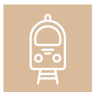
RAILWAY STATION 13 KM