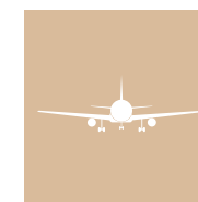
AIRPORT 16 KM