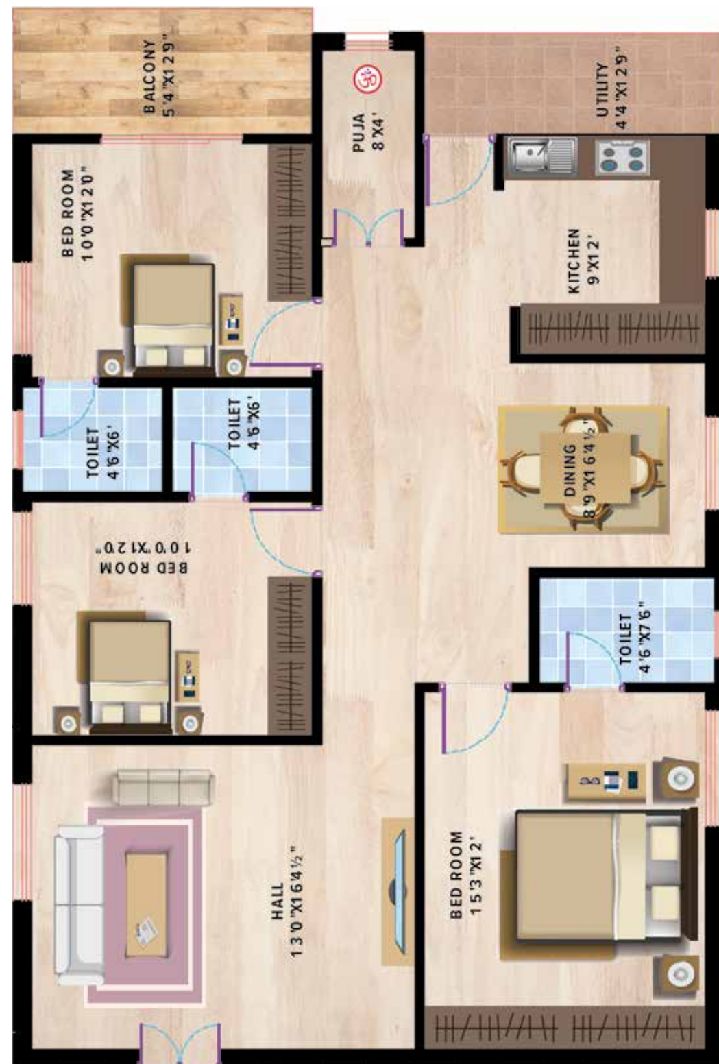
IMPERIA - II BLOCK-2 3BHK - WEST FACE FLAT NO 1 & 2