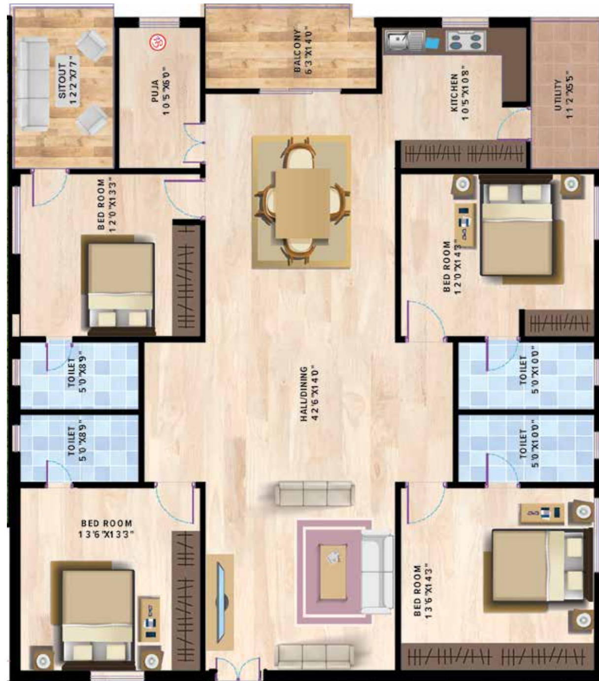
IMPERIA - I 4BHK - WEST FACE