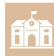
BLOOMING DALE SCHOOL 2.5 KM