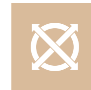
BENZ CIRCLE 8.8 KM